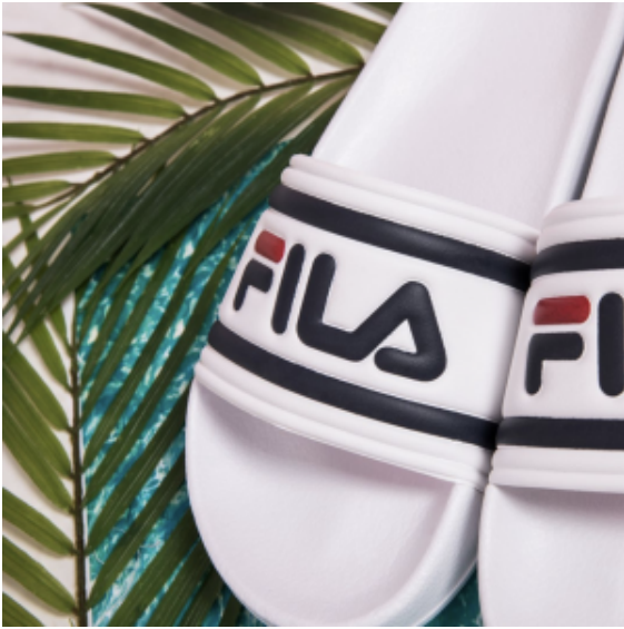
Pool Slides.

4. Tevas: Tevas are a summer camp classic that are actually very on-trend right now. They're comfortable and are great for walking, plus can be a great add on to a casual outfit.