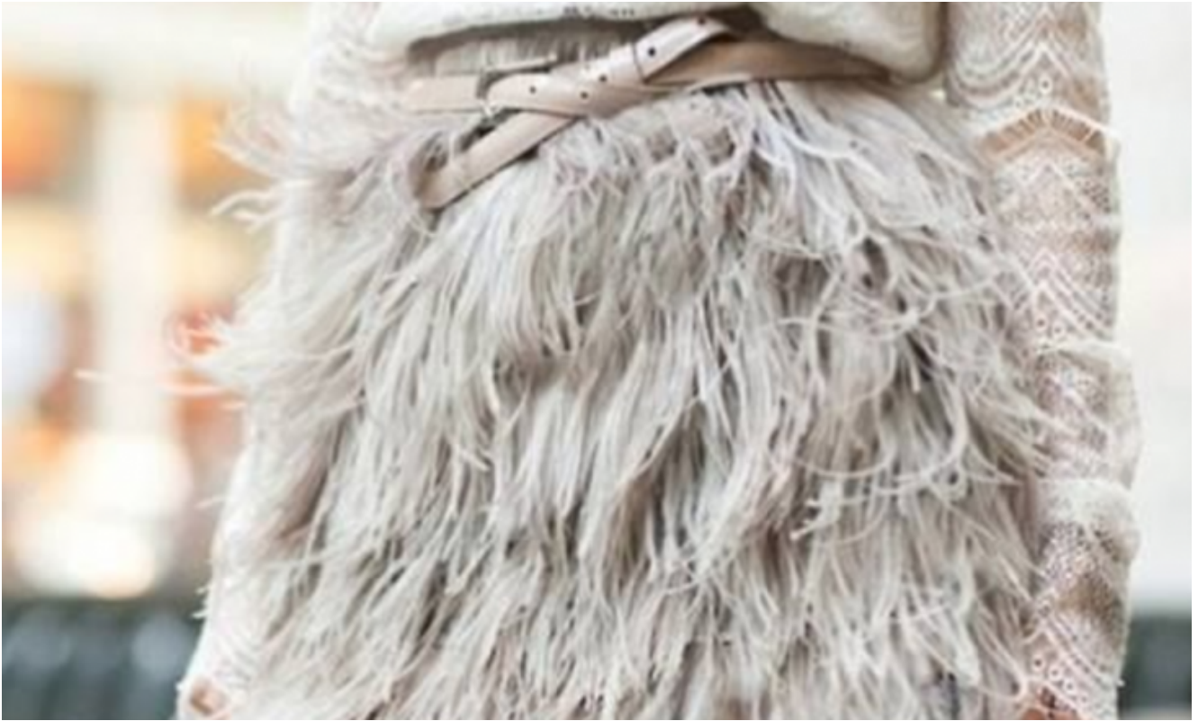
Feather Skirt

Get fun and flirty with an ostrich feather skirt, recently made popular by the new fashion trends for 2019. This is a great piece to have in your wardrobe because it can be dressed up or down. Not only is it eye-catching, but it goes great with a cashmere sweater or a blazer.