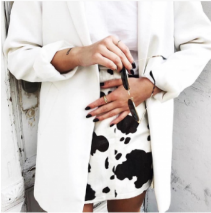
Cow Print Skirt

1. Cow Print: The splotchy black and white pattern is making a big come-back. This bold print can easily be paired with solid pieces, making it look classy instead of tacky.