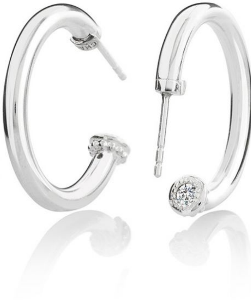
Crystal Capped Hoop Earrings Polished, $65

In addition to this new line of earring studs, Chamilia sells hundred of other jaw-dropping designs. We personally love the Crystal Capped Hoop Earrings Polished and the Origins Linear Earring .