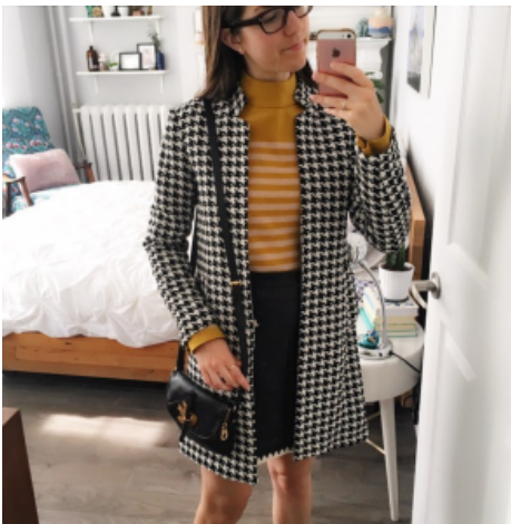
Houndstooth jacket.

2. Hounds-tooth: Honestly, this pattern is classic and timeless. Start adding small pieces to your closet that you can incorporate into an everyday look.