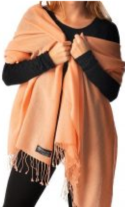
Pure Cashmere Shawl.

What can make you feel more attractive than cashmere? Each shawl is made from 100% cashmere wool in three ply. Measuring 36" by 80", they're long yet delicate enough to be versatile for any outfit. Whether you want to wear this shawl with a classic little black dress or a rock-inspired pantsuit, the 29 available colors will meet every need. Buy one, or several, while they're on sale to have as thoughtful gifts or for fashionable nights out.