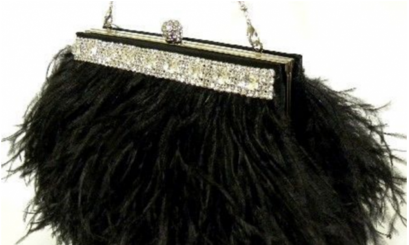
Feather Purse

We all need to be practical sometimes, right? Why not grab a clutch surrounded in ostrich feathers for your next date night? Or if you're the type of girl who has to shove everything into her bag, find a full-sized purse! It can either be covered in feathers or decorated along the trim of the opening of the bag, whatever strikes your fancy while you're shopping for your next carry-all accessory.