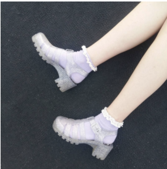
Jelly Sandals.

2. Jelly sandals: A super comfortable “ugly” shoe option is jelly shoes. Not only are these sandals a major throwback, but they are super cute and comfortable.