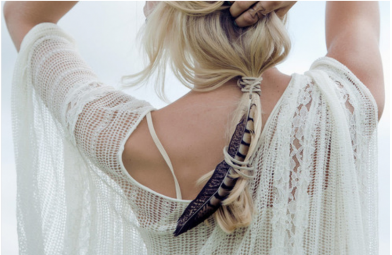
Hair feather accessory.

Probably one of the oldest feather accessories in existence, adding a feather to your hair can make you feel chic boho or whimsical without much effort. You can either tie one feather (like in the picture above) or get some clips that have feathers attached to them. Wearing them as an accessory this way might seem more natural if you don't like the other ways the trend has been gaining popularity.