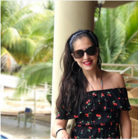
Cherry Dress.

3. Cherries: This print would be best for something more casual, like going to a movie or low-key happy hour. It is super fun and playful. You'll definitely make a statement in this fruity pattern.