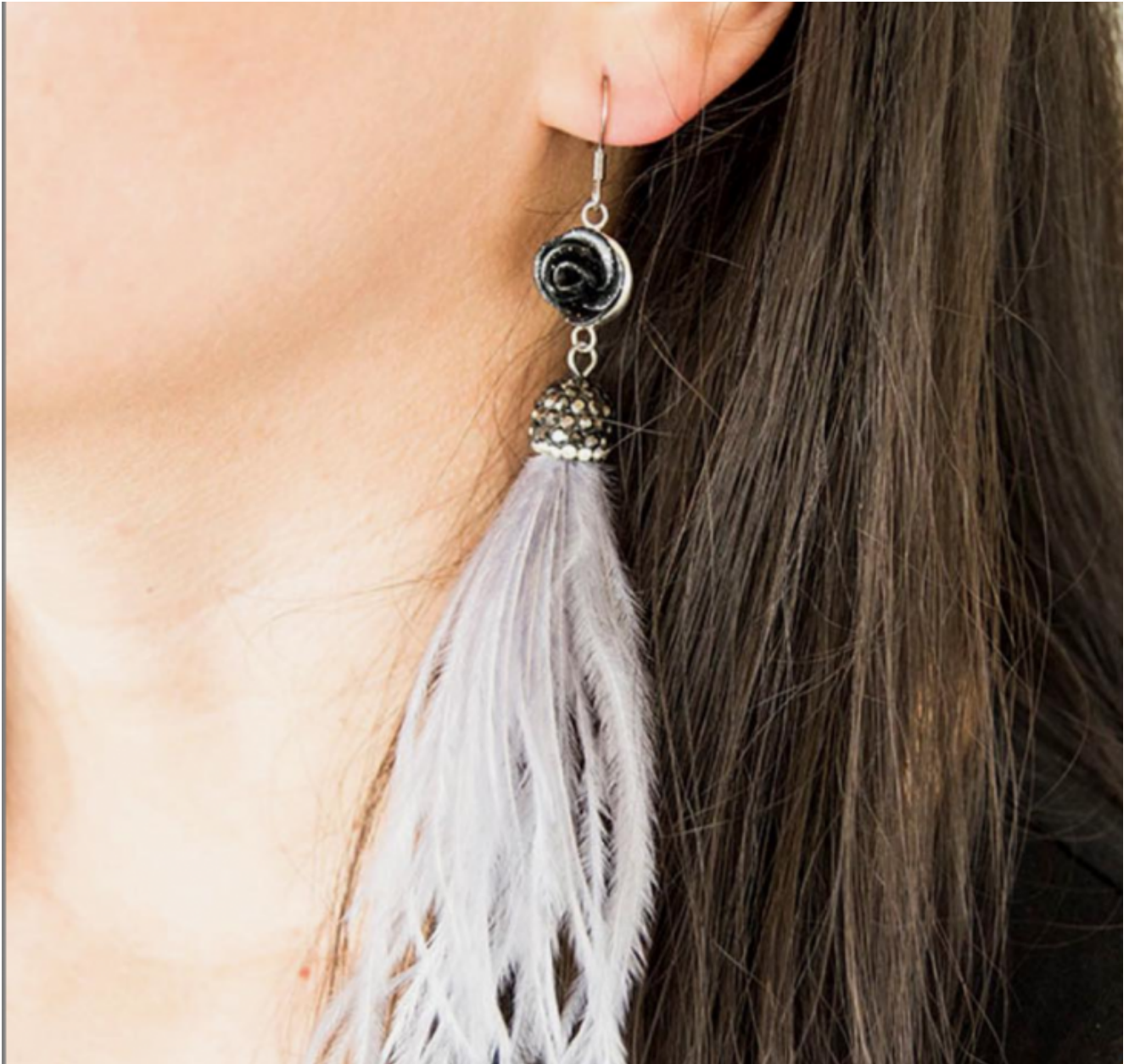
Feather Earrings

This playful accessory will dance on your neck and is sure to catch some attention with a messy updo. You can choose feather earrings with a few feathers dangling at the bottom, find a set that has multiple colors, or one single feather to float around your neck if that's more your style. Earrings are another great simple statement if you don't want to get crazy with feather coats or skirts.