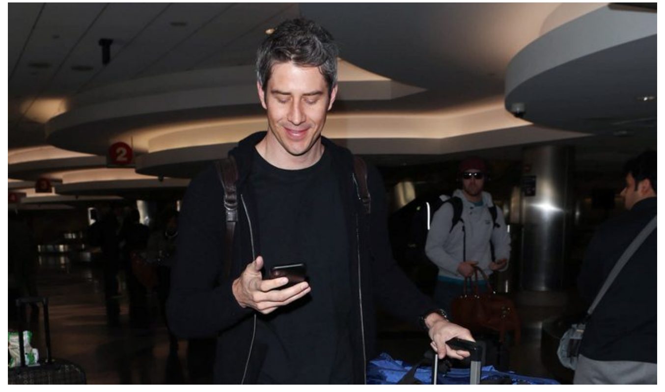
By Ahjané Forbes