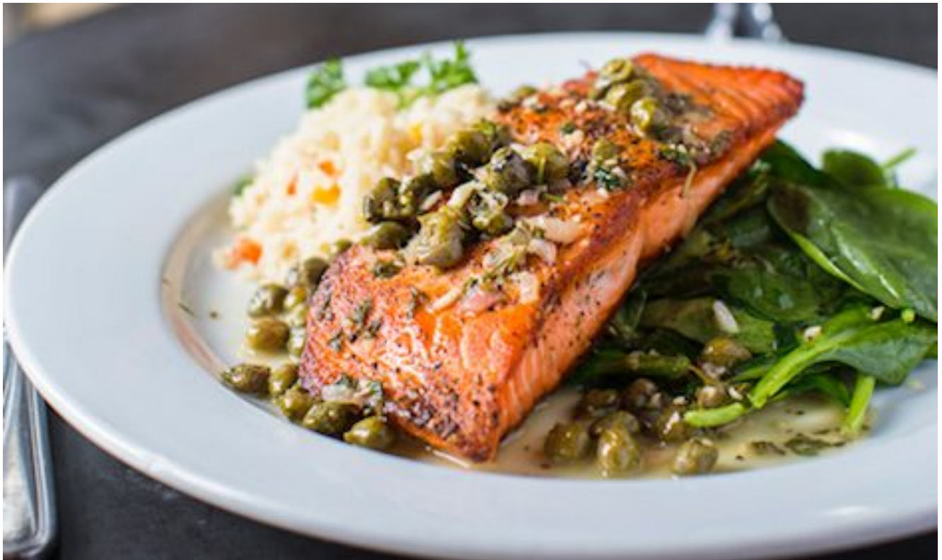
Roasted Salmon Dish