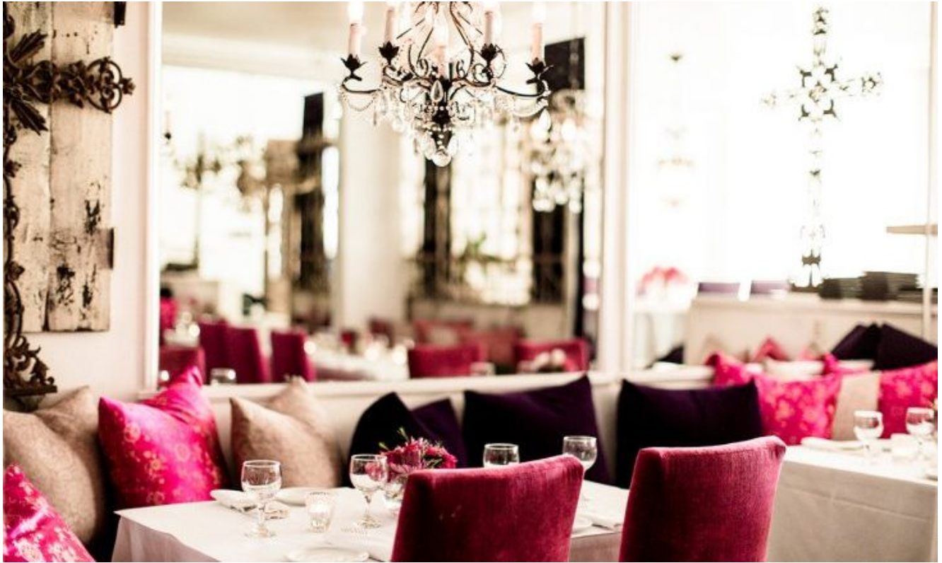
An elegant dining area at SUR