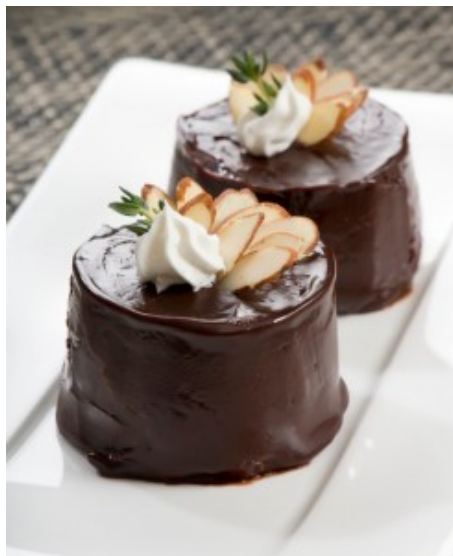
Almond Joyous Cheesecake Cuties.