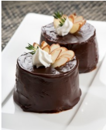
Almond Joyous Cheesecake Cuties.