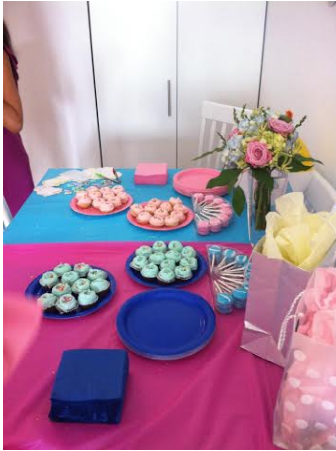
Brie's gender reveal party.