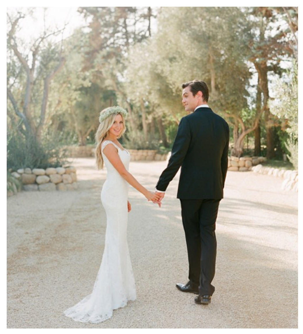
Ashley Tisdale and Christopher French on their wedding day.