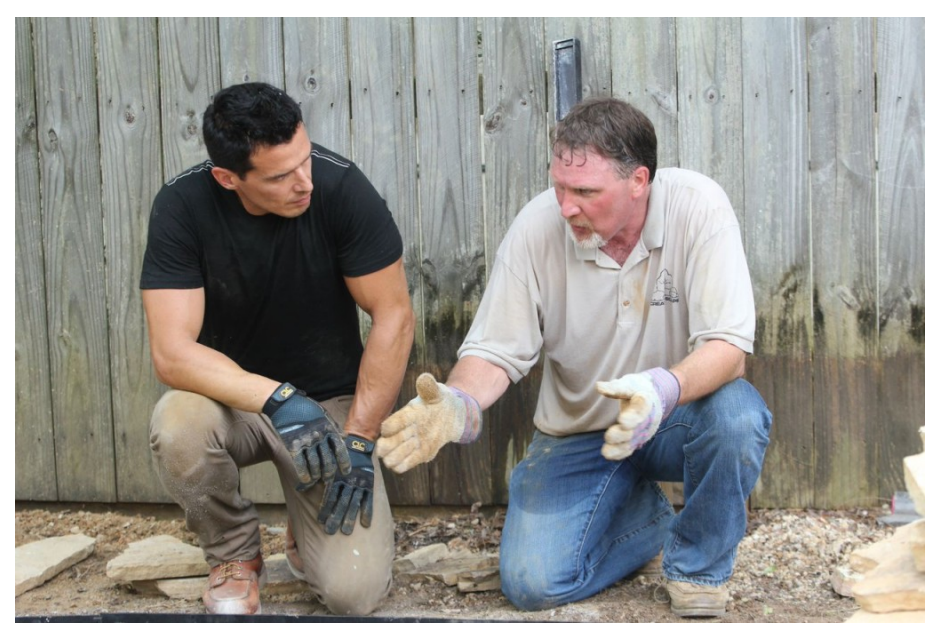
Antonio Sabato Jr. filming for 'Fix It or Finish It.'

ASJ: No secrets — he just told me to have fun.