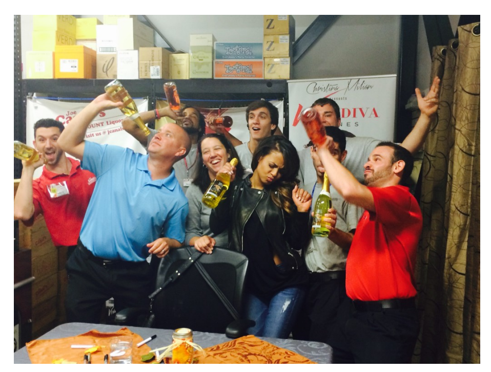
Christina Milian celebrating with Viva Diva Wines.

think we sometimes take things too seriously. Sometimes, you need to shout, dance, and scream out loud! You can be serious all day, or be a confident woman and just go have fun."