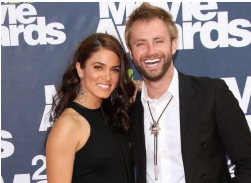
High School Musical

star Vanessa Hudgens is all grown up and has a new man. According to People , the brunette beauty has been seen at Hollywood awards shows and premieres with Josh Hutcherson from the Oscar Award Winning film, The Kids are Alright . This new development came just a few weeks Vanessa Hudgens' ex, Zac Efron, was seen heating it up with actress, Teresa Palmer.