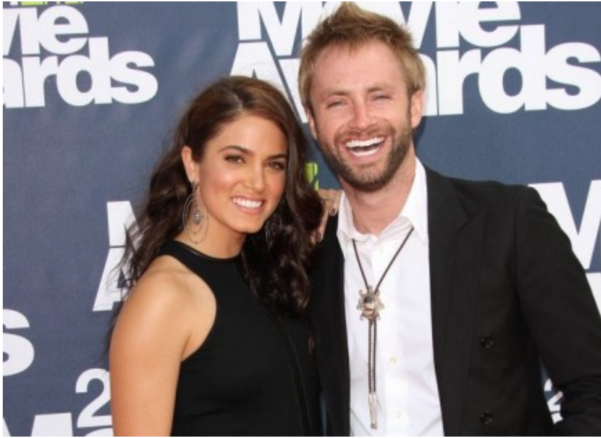
Red Riding Hood

actress Amanda Seyfried has finally confirmed dating rumors circulating around her and actor Ryan Phillippe, reports UsMagazine.com . In the April issue of Elle Magazine , Seyfried discussed both her budding relationship with Phillippe and the end of her relationship with Mamma Mia! costar Dominic Cooper. Seyfried and Cooper split when she found out that Cooper and his previous girlfriend were still together. "I was just kind of foolishly thinking that the two of them were done and Dom and I were involved. But we weren't really as involved as I thought. So I got my heart broken pretty hard," says Seyfried.