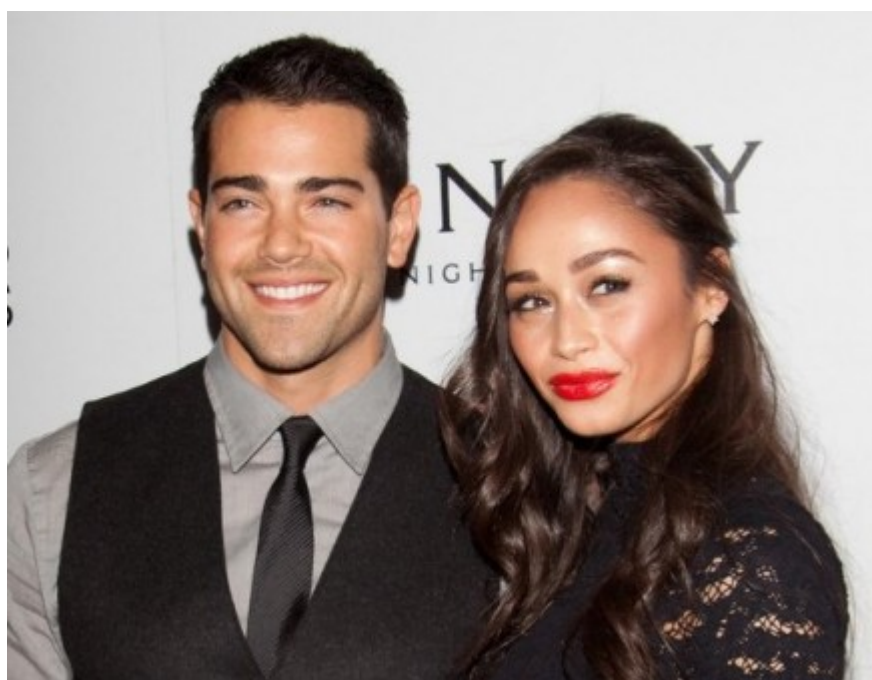
Drew Barrymore is