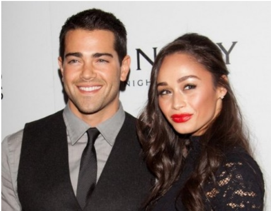
Backstreet Boy, A.J.