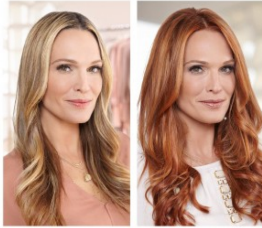
Molly Sims.

Sims certainly knows a thing or two about making a transformation – whether it’s with her hair color or her career. “My parents really taught me that I could be whoever I wanted to be,” she shares in our celebrity video interview. It’s important to have a positive attitude about change too: “Everyone gets stuck in a rut. You kind of just have to dig your way out.”