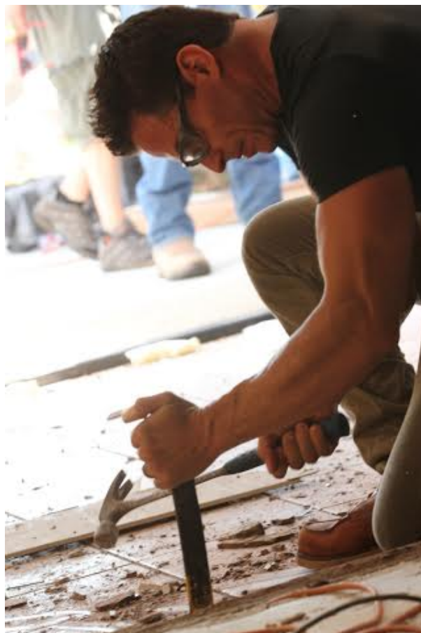
Antonio Sabato Jr. on 'Fix It

When it comes to Burke, he shares, “When they asked me who I wanted to dance with, I said Cheryl – and I got her! She’s everything that I need and then some. She’s tough and kind. I like to push myself, and she just pushes me to another level.”