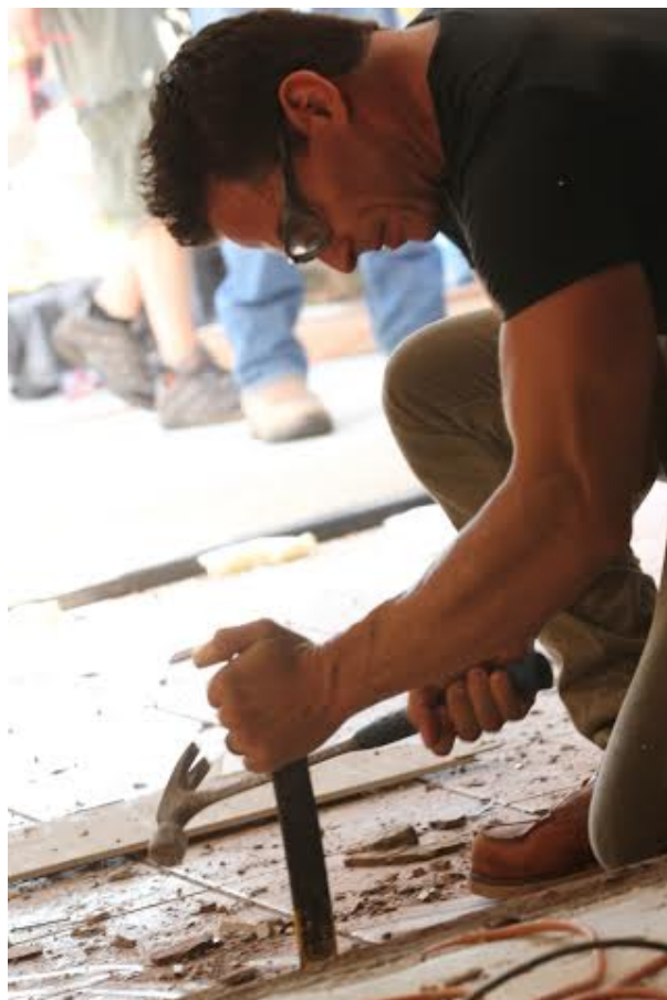
Antonio Sabato Jr. on 'Fix It

When it comes to Burke, he shares, “When they asked me who I wanted to dance with, I said Cheryl – and I got her! She’s everything that I need and then some. She’s tough and kind. I like to push myself, and she just pushes me to another level.”