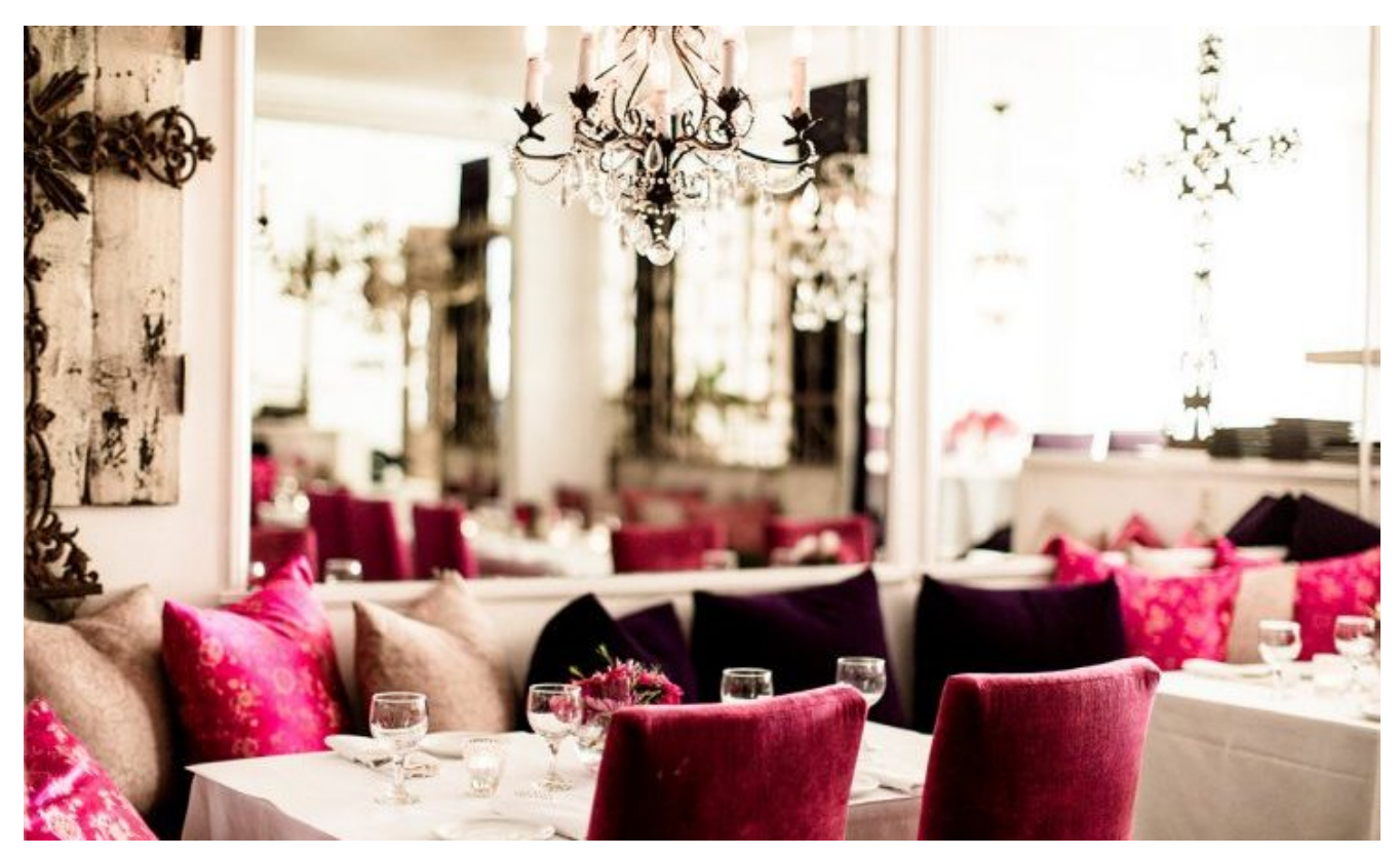
An elegant dining area at SUR

Southern European cuisine, making you feel like you have traveled abroad without leaving LA.