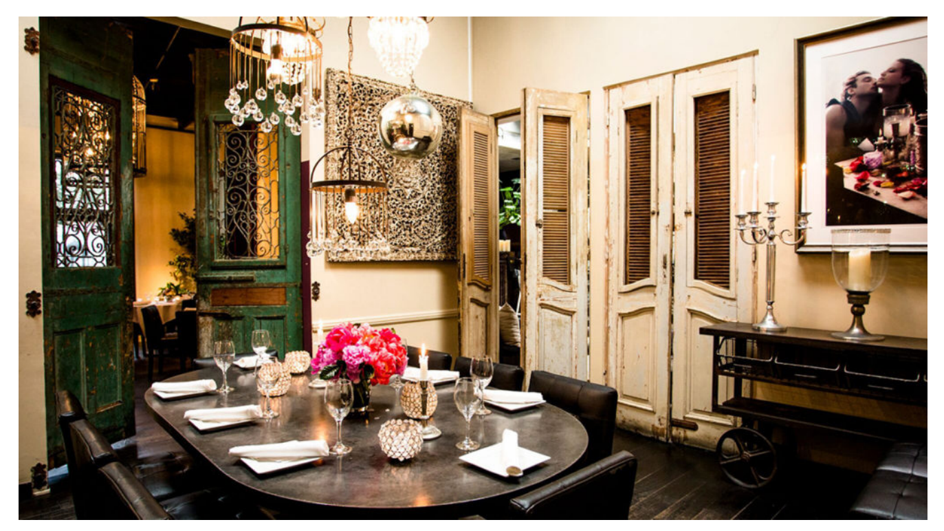
One of the many dining rooms at SUR

Outside of the ambiance, the food is what makes this restaurant stand out. Bizzoco had the opportunity to try out various items from the SUR menu. She started out with the Chicken Steamed Dumplings and Fried Goat Cheese appetizers, which were both delicious.