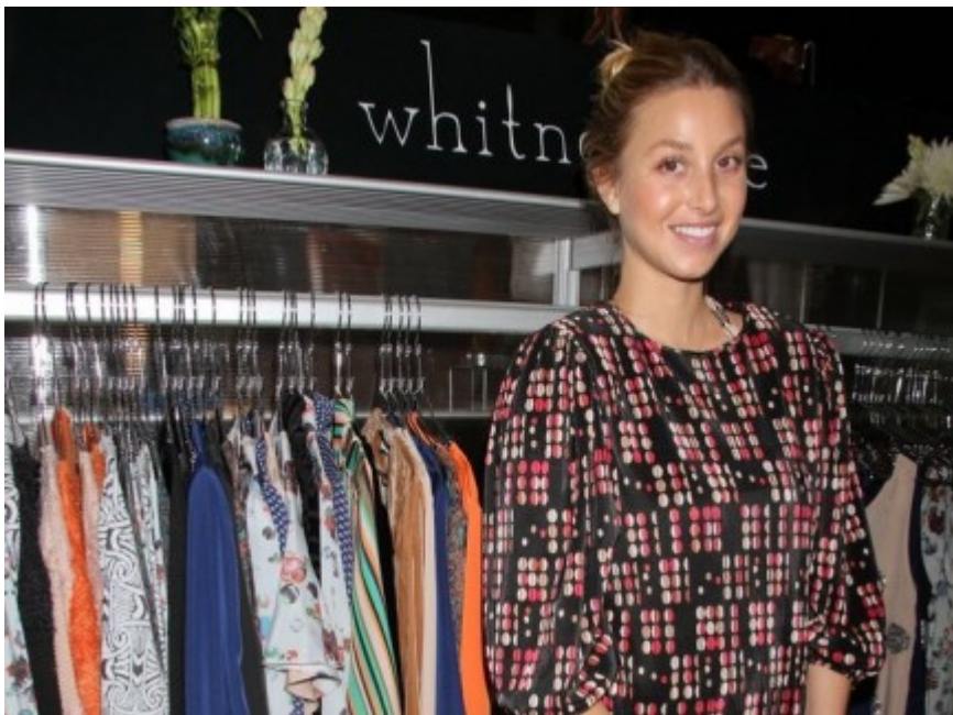
New York's Fashion