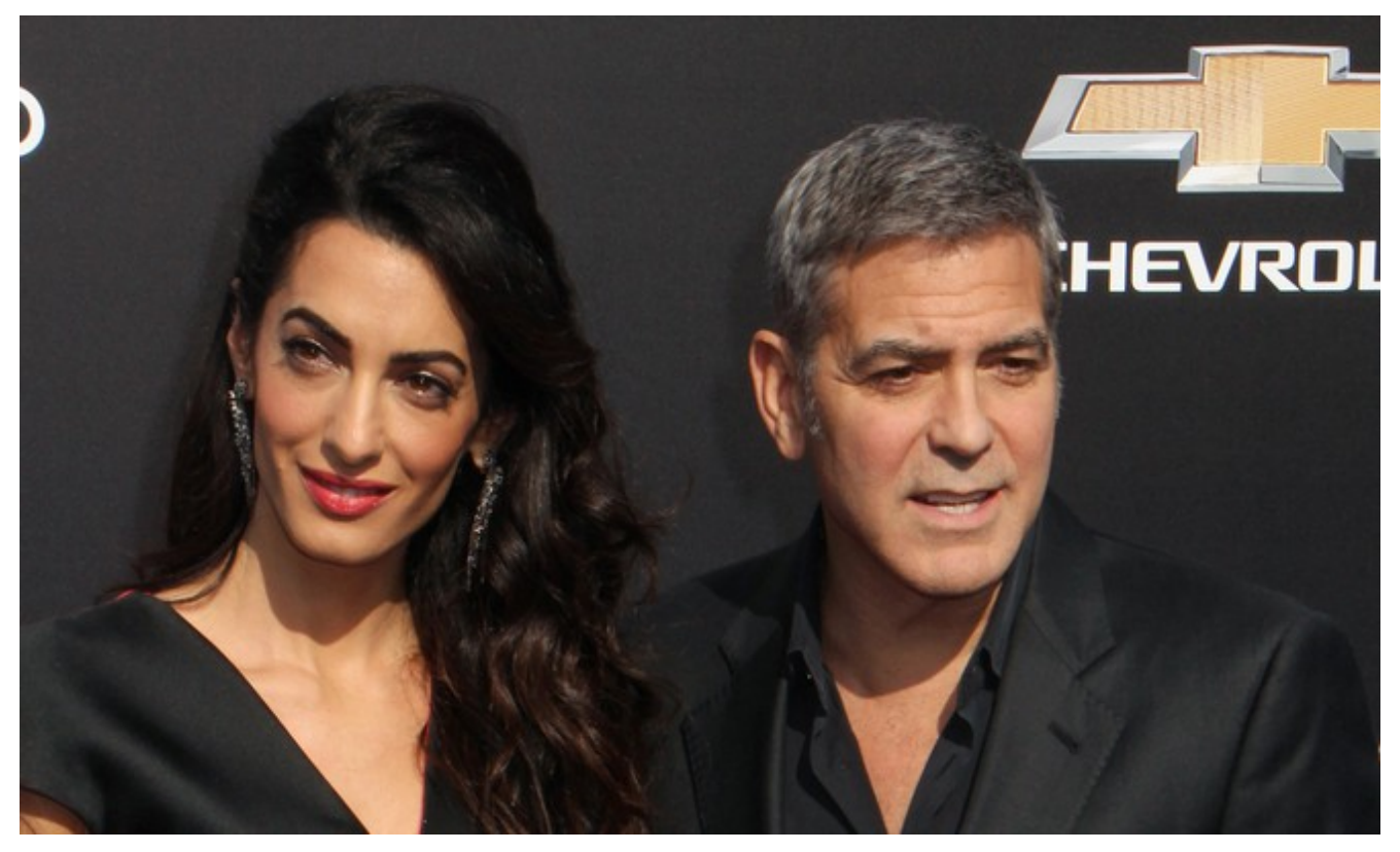
By <u>Katie Gray</u>

Pop stars know how to pop out cute <u>celebrity babies</u>! They're not only good at making music, but they also make beautiful children. Some of these lovely ladies are in <u>celebrity relationships</u> or have had <u>celebrity weddings</u>, while others are going strong as single moms. No matter what their current situation is, one thing is for sure — they all have beautiful celebrity babies!