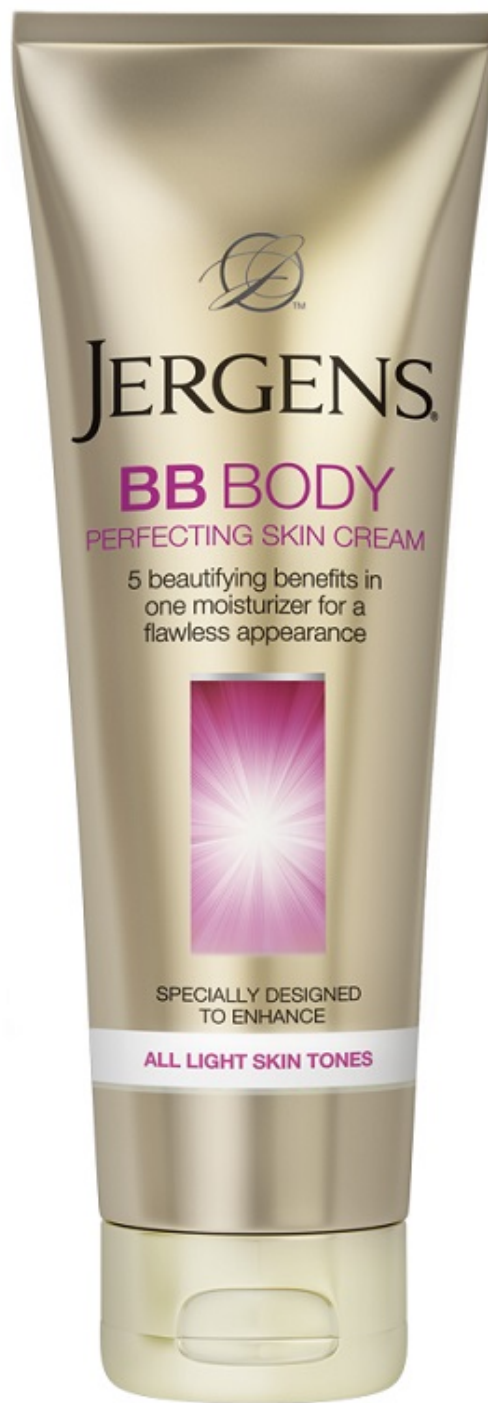
Jergens® BB Body Perfecting Skin Cream

Jergens® BB Body Perfecting Skin Cream will not only hydrate and illuminate your skin as soon as you put it on, but it will firm, even, and correct it after only five days of use. Plus, it dries quickly, so there's no need to adjust your usual morning routine to avoid staining your clothes. Better yet, this BB cream goes on sheer and adjusts to your skin tone, so you won't look like you just tried to rub pudding on