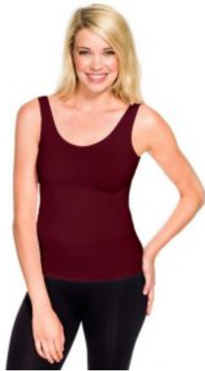
Basic Tank.

Available in over thirty colors, including some mouth watering shades like Pink Lemonade, Kiwi, and Mulberry, this tank is the perfect addition to any wardrobe. Whether it's worn as a base layer or on its own, this tank adds depth to any outfit. Its size perfectly hides bra straps and hits just below the hips for a slimming and lengthening affect. The material prevents slipping and shifting throughout the day, so those constant tugs and adjustments will be a habit from the past. It's the wardrobe solution you didn't know you needed designed by fashion industry veteran Linda Schlesinger. Priced at $34, it's a quality investment in your mother's attire to help her look and feel her best.