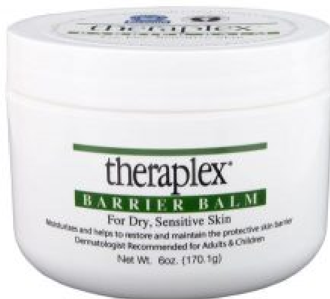
Theraplex Barrier Balm

Theraplex® isn't just for those with overly dry skin. It is for anyone looking for a gentle formula to apply to their skin when trying to keep it hydrated and moisturized, which is so important during summer. These products are guaranteed to leave you glowing on your next date night !