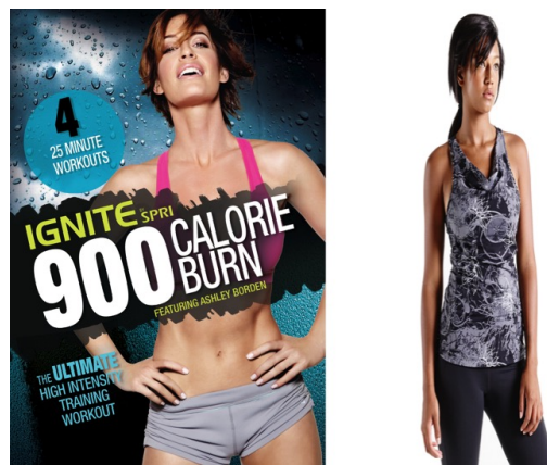
900 Calorie Burn DVD and the Petal Back Racer Tank from Gaia.

Our favorite drink for the holiday season is the Ginger Snap, which is two ounces of American Born Moonshine in Apple Pie mixed with four ounces of ginger ale. It's the perfect treat to warm you up after a chilly day spent playing in the snow with your loved ones! That special guy in your life will love adding this unique liquor to his bar selection.