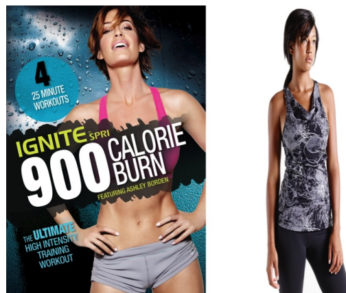
900 Calorie Burn DVD and the Petal Back Racer Tank from Gaiam.

Our favorite drink for the holiday season is the Ginger Snap, which is two ounces of American Born Moonshine in Apple Pie mixed with four ounces of ginger ale. It's the perfect treat to warm you up after a chilly day spent playing in the snow with your loved ones! That special guy in your life will love adding this unique liquor to his bar selection.