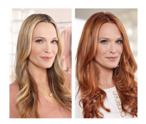
Molly Sims.

When it comes to keeping her red color, the former Sports Illustrated supermodel depends on <u>Nexxus</u> Color Assure products. "If something's going to save me time and make me look good, I'm all for it!" she enthuses.