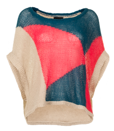
Quantum Sweater.

blocking top also changes with the seasons taking you from spring to summer and even into fall!