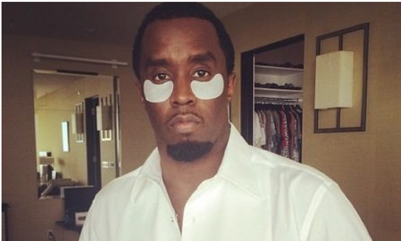
P Diddy sporting collagen eye gels