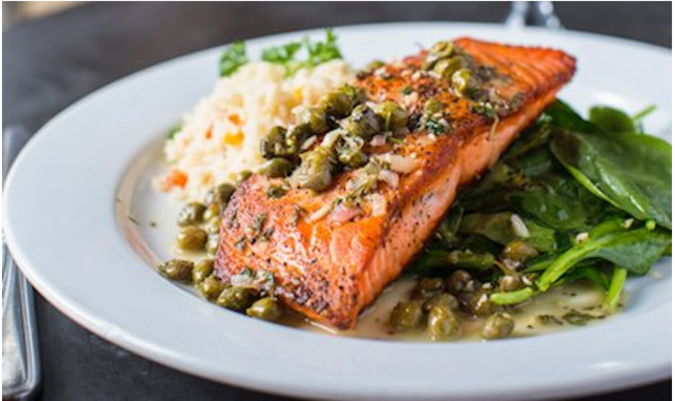
Roasted Salmon Dish