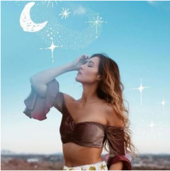
Bandeau top.

4. Dress it up!: Your bandeau is strong enough to wear on its own. You can always style your cute outfit with some jewelry or other accessories. This universal top can be worn casually with jeans or it can be dressed up with dress pants. Accessorizing is everything with a simple top. Not into a lot of jewelry? Pick out a printed bandeau and go.