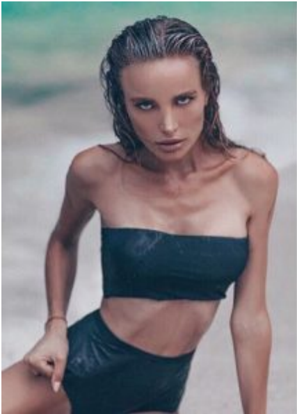
Bandeau swimsuit.

3. The Original: The bandeau was originally used for the beach as the top to a bathing suit. Ready for a beach day? For whatever color or style you feel that day, wearing your bandeau will keep you comfortable and ready to enjoy the day!