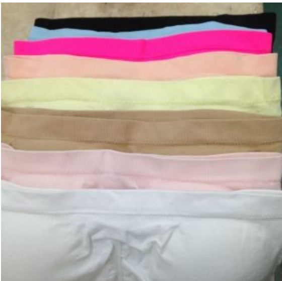
Bandeau bras.

Related Link: Fashion Trend: One Piece Swimsuits