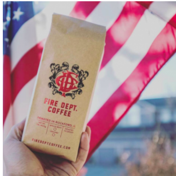
Fire Department Coffee.

Fire Department Coffee is coffee with an admirable mission and that's tasty for the consumer. Coming in a variety of blends and flavors, their original medium roast is one of the easiest drinking coffees you will ever have. If you like something bolder, their dark roast is made from organic beans and comes from fair trade farms. Their newest flavor: Bourbon-infused. It has the smoothness of Bourbon totally guilt-free. A portion of all sales are donated to military and fire-related charities. Military and first-responders receive 15% off their first order.