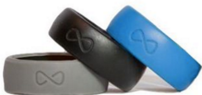
Groove Life Rings.

The Groove Life ring is a safe ring that keeps comfort at the forefront. Made from low profile silicone and carved with their patented design, the ring promotes airflow for the fingers, keeping moisture out and preventing poor circulation. It's far more comfortable than the traditional metal ring and