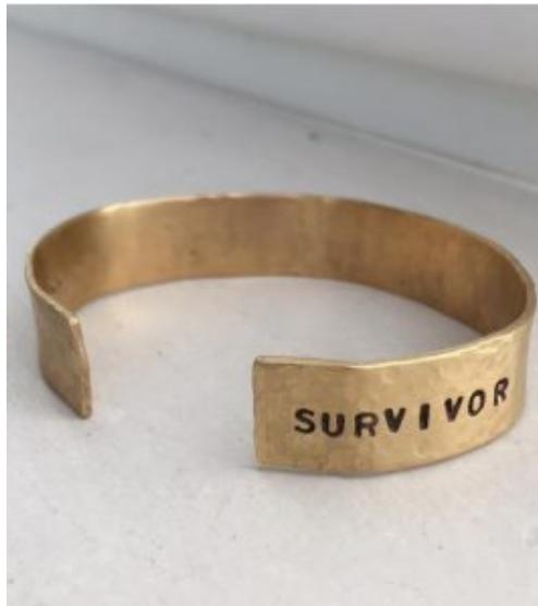
Isabelle Grace Jewelry.

With a great mission behind the company, each design supports breast cancer awareness and making women feel beautiful and strong. Isabella Grace bracelets are all about being unique and elegant, with a timeless and effortless look. Made by hand in the USA from recycled materials whenever possible. The bracelets are a symbol of the importance of living with hope and strength. With a sizable celebrity following, such as Katherine Heigl, Courtney Lopez, Alyson Hannigan, and Christina Milian, these bracelets are gorgeous for any woman to wear.