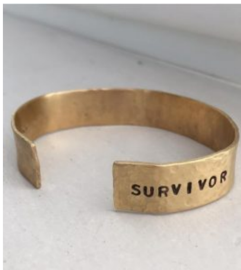
Isabelle Grace Jewelry.