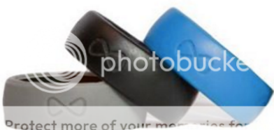
Groove Life Rings.

The Groove Life ring is a safe ring that keeps comfort at the forefront. Made from low profile silicone and carved with their patented design, the ring promotes airflow for the fingers, keeping moisture out and preventing poor circulation. It's far more comfortable than the traditional metal ring and