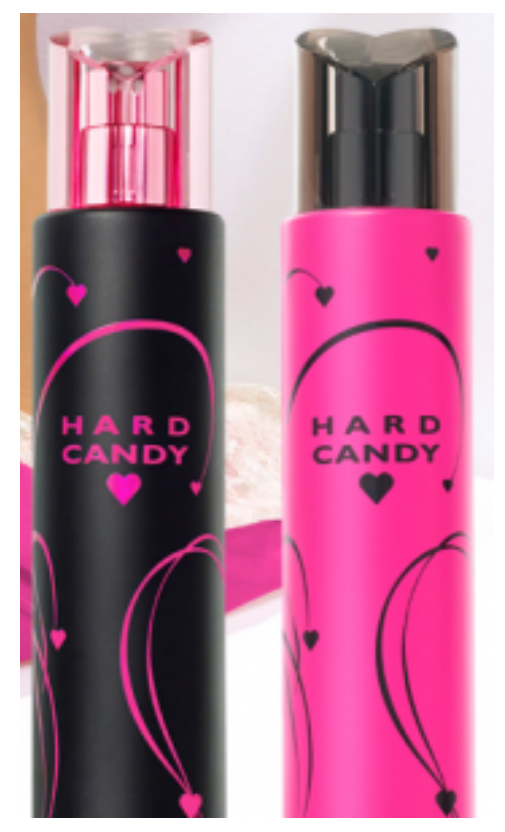
Hard Candy Perfumes.

Exclusively available at Walmart, Hard Candy perfumes are the perfect budget-friendly beauty product to make you feel confident going out on the town. Available in Pink and Black scents featuring a blend of fresh fruits and elegant musks, these perfumes were inspired by the confident, edgy, and flirtatious Hard Candy girl herself. With top notes of fruit, middle floral notes, and lower, sweeter flavors, these perfumes will keep people intrigued.