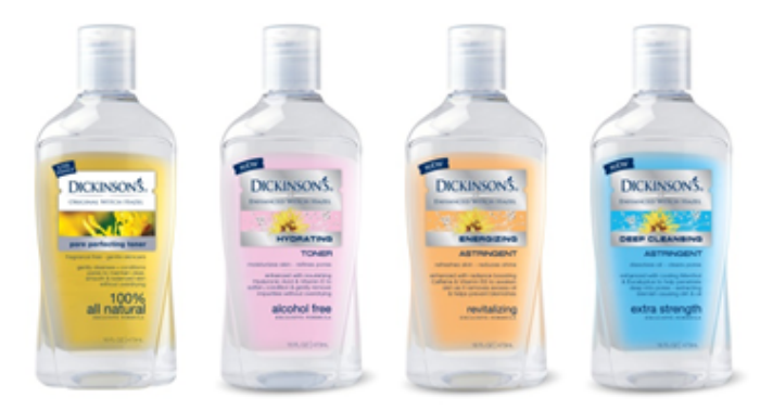
Dickinson's Toner.

With the first ingredient listed being 100% natural witch hazel, you know what you're putting on your face is great for your skin. Witch hazel is a natural remedy that removes oil and impurities without drying your skin out. Dickinson's toner is a gentle way to remove makeup, free of soaps, dyes, parabens, or sulfates. Fighting winter skin blues starts with your skincare routine, so find products that are healthy for your face.