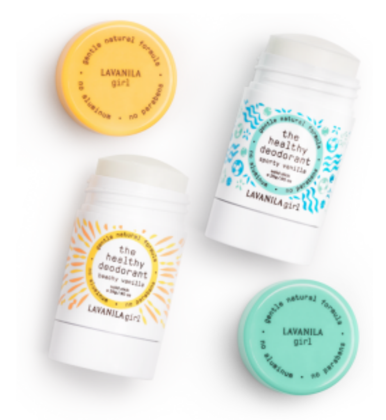
Lavanila Healthy Deodorant.

This deodorant is specifically engineered for tween and teen girls. It's an all-natural, powerful, gentle, and nonirritating deodorant that is also non-whitening. Super soft under the arms, this solid twist-up beauty product is vitaminrich without the inclusion of aluminum or other harsh chemicals. Using health-promoting beta-glucan technology with antioxidants, active botanicals, and essential oils, it will fight underarm odors by preventing the growth of bacteria. Available in Beach Vanilla or Sporty Vanilla, help your teen feel flawless with this healthy deodorant!