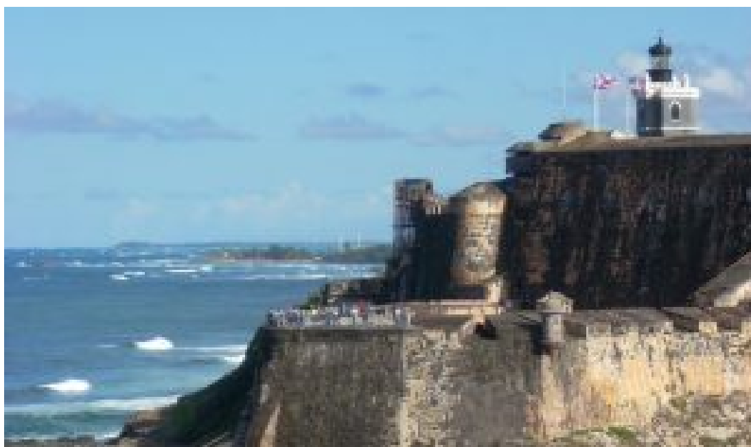
Travelers visit Old San Juan in Puerto Rico.

and culture. Explore historical sites and souvenir shops in between your visits to the beach. Not to mention all the amazing pictures you'll take at this picturesque island! Round trip flights start at $225 if departing from JFK. Since San Juan is a small city, a taxi ride can range from $10 to $20 depending on which hotel you're staying at. And if you're looking for good deal on a hotel, you're guaranteed a lovely stay at the Hyatt House and Wave Hotel Condado, both of which have rooms available for $119 per night with breakfast included. If you're worried about your other meals for the day, delectable Puerto Rican dishes can be found throughout the island. Give pernil a try, it's a slow-roasted marinated pork shoulder that is typically served with rice and beans.