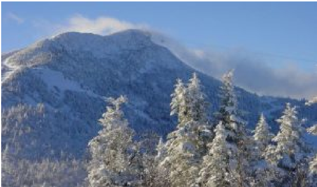
Mountain top view of Killington, Vermont.

only a few hours away from major East Coast cities like New York and Boston, so if you're from those areas it's only a short drive. Those who live a bit further can take a long-distance bus service, which can range from $45 to a little over $100 depending on where you depart. Flights are a bit more, roughly $207 for a round trip ticket from NYC in March. However, the price of lodging make up for the costs of travel. Budget-conscious couples can get a no-frills stay at the Hillside Inn for $87 a night, or splurge on a couples package at the Killington Mountain Lodge for about $165 per night. Vacation rentals are also available if you're planning on a longer stay, which is more economical if you're cooking your own meals. If cooking isn't your thing, enjoy fireside meals at The Foundry at Summit Pond or the Pickle Barrel.