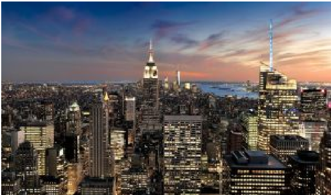
New York City skyline at sunset.

or just stick to free and donation-based attractions. Parking can be a nightmare, so if you don't live far, you can take a bus or Amtrak train to Penn Station and transfer to a subway line. However, for those who live farther, like the West Coast, a round trip flight from LAX to New York is about $320. If you're a budget traveler, save money by staying at a hotel with a communal bathroom like the Jane Hotel for $59 a night, or get your own space at the chic Row NYC for $146 per night. As for food, you have over 24,000 restaurants to choose from—so you're sure to find places that fit your budget easy for date night.