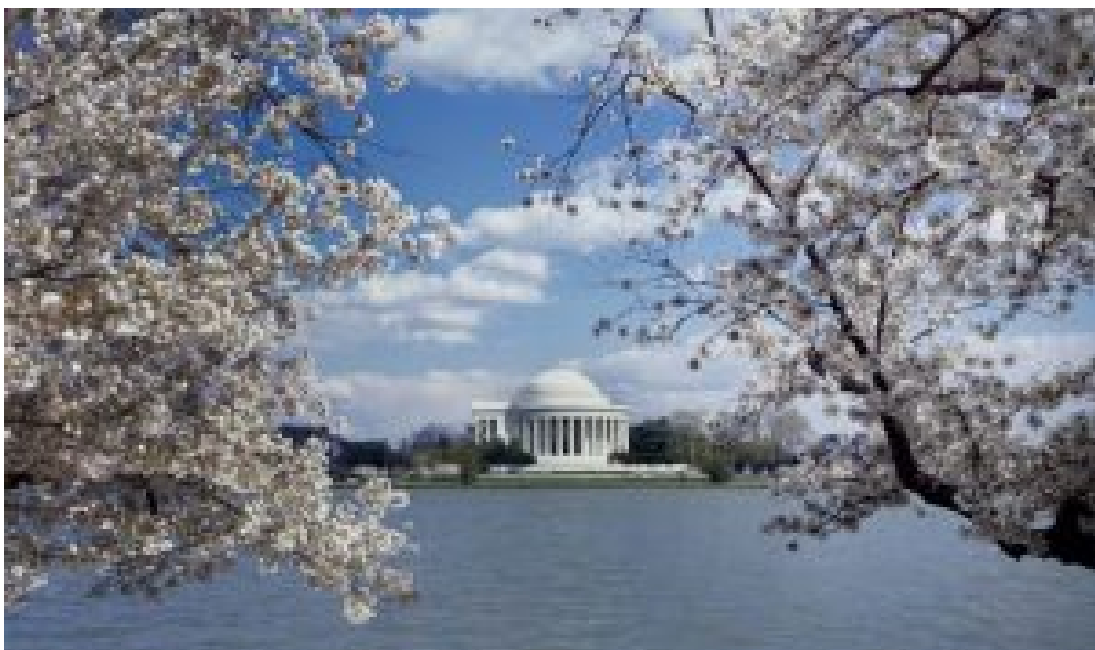
Scenic view of Cherry Blossoms and the Jefferson Memorial in Washington, D.C.

history, politics and government? Then a trip to the nation's capital might be a fun spring break vacation. Late March and early April are perfect times to visit because the city's Cherry Blossom Festival is celebrated during this time, which is super romantic for couples! Almost all of the museums and monuments are free, so you'll save a bunch of money while you explore the capital. Washington, D.C. is easily accessible, especially for those on the East Coast. You can get there by car, bus, train or plane. Don't fret if you live on the West Coast however, round trip flights from LAX to D.C. are as low as $107. Since D.C. is a major city, hotels are on the pricey side, but look for places that include lodging and breakfast, such as the Windsor Park Hotel which goes for $153 a night, and the Comfort Inn for $111 per night. D.C. is also known for its unique restaurants like Bindaas, which is famous for its Indian-inspired menu, and &Pizza, where you can customize your own pizza and gulp down artisanal soda.