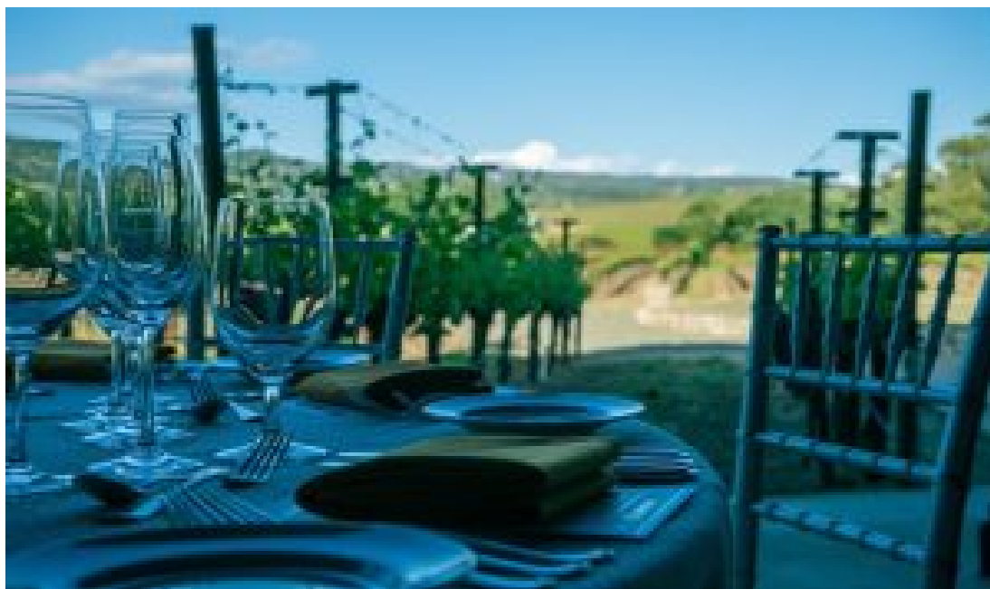
Shot of a table with wine glasses in Sonoma County, California.

live farther, it's also much cheaper to take a flight to San Francisco or Oakland than taking a direct flight to Sonoma. However, round trip flights from JFK around the time of March and April are in the $300 range, so be wary East Coast budget travelers. Also, hotels in Sonoma are on the higher-end side, so it might be better to save money with value lodging at the Best Western Sonoma Valley Inn for $138 a night and the Sonoma Creek Inn for $126 per night. If you're a big wine fan, there are countless wine tours you can take. Platyus Wine Tours provides guests four visits to family owned wineries for $110 per person, and includes a picnic lunch, while Valley Wine Tours provides four to five winery visits for $135, and includes a gourmet lunch. If wine tours aren't your thing, you can have fun exploring the Sonoma Plaza, which has plenty of boutiques, galleries and restaurants.