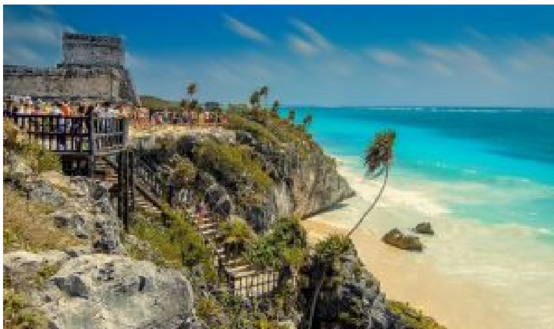
View of the beach in Tulum, Mexico.

1. Tulum, Mexico: Tulum is a gorgeous location for couples that like to soak up the sun and sand. It's almost like Cancun's mature older sibling, so you don't have to worry about rowdy college parties interrupting your bonding. There are also preserved Mayan ruins, so Tulum is a great spot for those who appreciate archaeological sites. The nearest airports to Tulum are in Cozumel and Cancun, ranging from 60 to 80 miles respectively; but luckily round trip tickets from either start at $294 in March. After landing, if you don't want to splurge on a taxi, you can take an ADO bus. And of course, don't forget to book a stay at one of Tulum's high-end budget hotels like the Mango Tulum Hotel for $105 per night, or the Hotel Latino for $82 a night. As always, stick to local restaurants if you want tasty cheap eats.