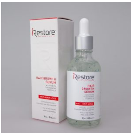
iRestore Hair Growth Serum & Packaging

iRestore launched its new hair growth serum this September, and it has been seeing the best results. The hair growth serum helps grow thicker and healthier hair and was developed using an advanced thickening formula, Redensyl®, that is clinically proven to stimulate hair growth for both men and women. This solution is noninvasive and made of natural ingredients that proliferate hair growth and allows users to have more beautiful hair without negative side effects. While the serum is designed for those with thinning hair and alopecia, it is helpful for those not suffering from this who just want thicker and healthier hair. By applying 1ml two times a day directly onto the scalp in areas of hair loss or desired areas of growth, users can expect to see significant visible results in as little as three months. For only $39.99, you can keep your hair full and strong during the harsh colder months! While there are no dangerous ingredients, it is not recommended for pregnant women and children.