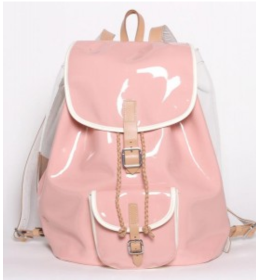
The Takashi bag by Harper Avenue.

In our exclusive author interview, the dating expert gives us a glimpse behind the evolution of clutch and reveals her best relationship advice about online dating and having the courage to find true love. And the best part? If you're still searching for the perfect gift this holiday season, the Takashi bag by Harper Avenue is a must-have holiday item. Use the discount code below for 20 percent off!