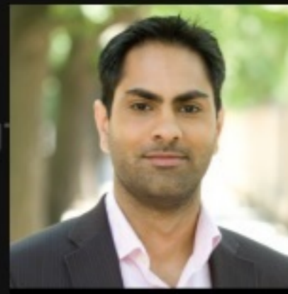
Ramit Sethi iwillteachyoutoberich.com