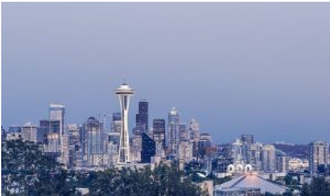
View of the Seattle, Washington skyline with the Space Needle.

7. Seattle, Washington: Seattle is a dazzling eyeful for city-loving travelers that still like being in touch with nature. Combined with modern architectural wonders and beautiful views of the Puget Sound, Seattle offers many fun activities. Make sure you get plenty of pictures of yourself at the world-famous Space Needle and Frye Art Museum. From the East Coast, flights start at $328, but if you're from the West Coast, a round trip ticket can be as low as $104. Amtrak is also an option if you don't live far. Fortunately, compared to other major cities, Seattle has moderate priced hotels. Located in the heart of the city, the Best Western PLUS Pioneer Square Hotel and Mediterranean Inn are both around $149 per night. Seafood lovers will thoroughly enjoy the food in Seattle. You can catch your own fish for free from a fishmonger at the Pike Place Market, or grab a bite at the Tilikum Place Café.