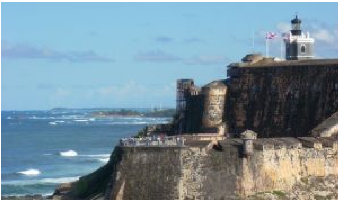
Travelers visit Old San Juan in Puerto Rico.

4. San Juan, Puerto Rico: Going back to warm and exotic climates, San Juan is a lovely beach destination. Located in the heart of the Caribbean, San Juan is a city full of history and culture. Explore historical sites and souvenir shops in between your visits to the beach. Not to mention all the amazing pictures you'll take at this picturesque island! Round trip flights start at $225 if departing from JFK. Since San Juan is a small city, a taxi ride can range from $10 to $20 depending on which hotel you're staying at. And if you're looking for good deal on a hotel, you're guaranteed a lovely stay at the Hyatt House and Wave Hotel Condado, both of which have rooms available for $119 per night with breakfast included. If you're worried about your other meals for the day, delectable Puerto Rican dishes can be found throughout the island. Give pernil a try, it's a slow-roasted marinated pork shoulder that is typically served with rice and beans.