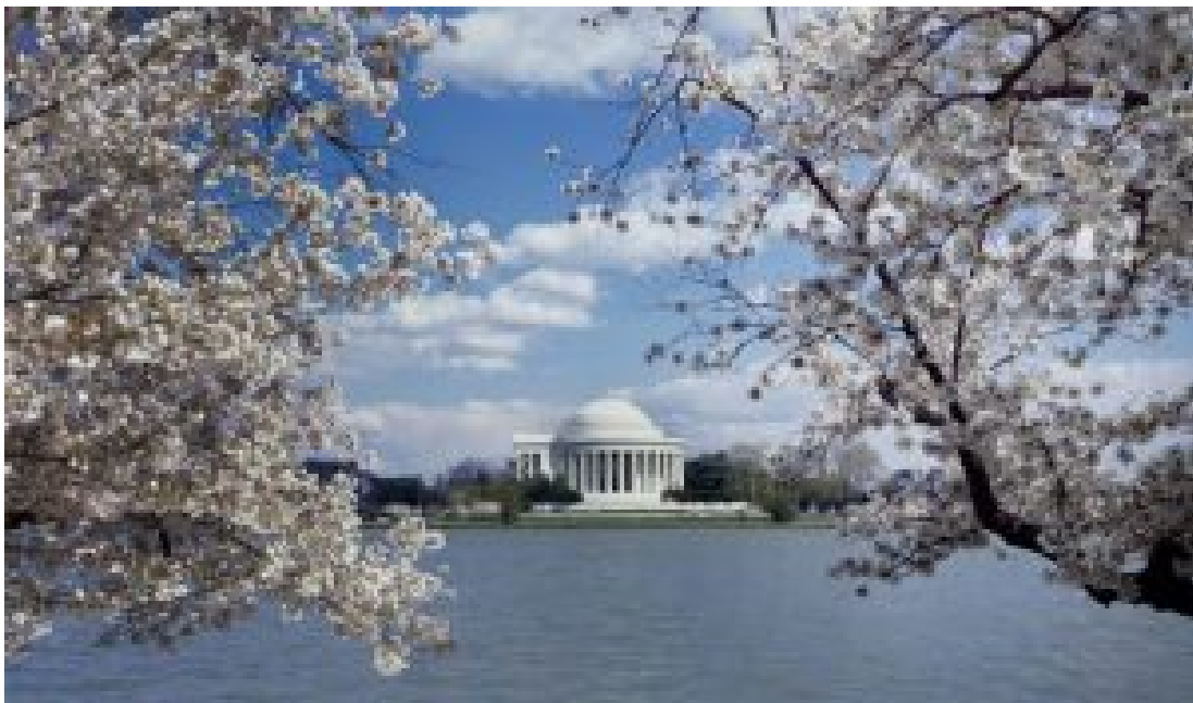
Scenic view of Cherry Blossoms and the Jefferson Memorial in Washington, D.C.

3. Washington, D.C.: Do you or your loved one enjoy discussing history, politics and government? Then a trip to the nation's capital might be a fun spring break vacation. Late March and early April are perfect times to visit because the city's Cherry Blossom Festival is celebrated during this time, which is super romantic for couples! Almost all of the museums and monuments are free, so you'll save a bunch of money while you explore the capital. Washington, D.C. is easily accessible, especially for those on the East Coast. You can get there by car, bus, train or plane. Don't fret if you live on the West Coast however, round trip flights from LAX to D.C. are as low as $107. Since D.C. is a major city, hotels are on the pricey side, but look for places that include lodging and breakfast, such as the Windsor Park Hotel which goes for $153 a night, and the Comfort Inn for $111 per night. D.C. is also known for its unique restaurants like Bindaas, which is famous for its Indian-inspired menu, and &Pizza, where you can customize your own pizza and gulp down artisanal soda.