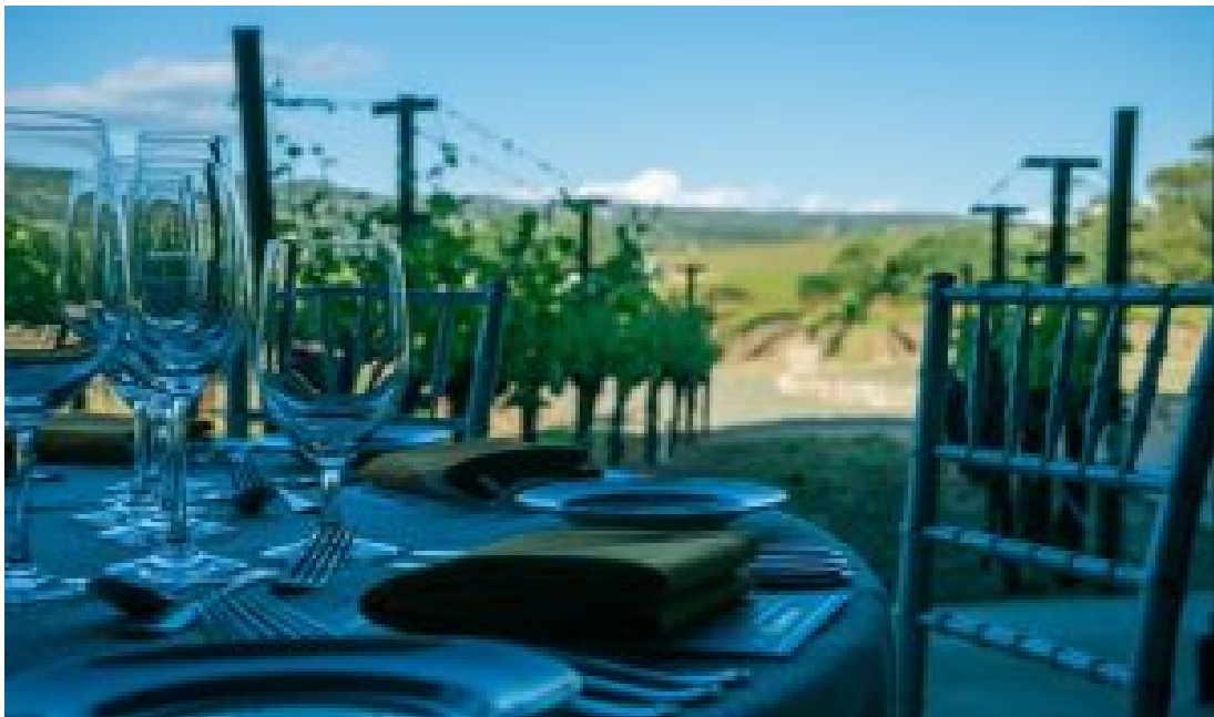
Shot of a table with wine glasses in Sonoma County, California.

activities such as hiking and horseback riding. Sonoma is roughly 50 miles from San Francisco and Oakland, so it's accessible by car if you aren't far from there. For those who live farther, it's also much cheaper to take a flight to San Francisco or Oakland than taking a direct flight to Sonoma. However, round trip flights from JFK around the time of March and April are in the $300 range, so be wary East Coast budget travelers. Also, hotels in Sonoma are on the higher-end side, so it might be better to save money with value lodging at the Best Western Sonoma Valley Inn for $138 a night and the Sonoma Creek Inn for $126 per night. If you're a big wine fan, there are countless wine tours you can take. Platyus Wine Tours provides guests four visits to family owned wineries for $110 per person, and includes a picnic lunch, while Valley Wine Tours provides four to five winery visits for $135, and includes a gourmet lunch. If wine tours aren't your thing, you can have fun exploring the Sonoma Plaza, which has plenty of boutiques, galleries and restaurants.