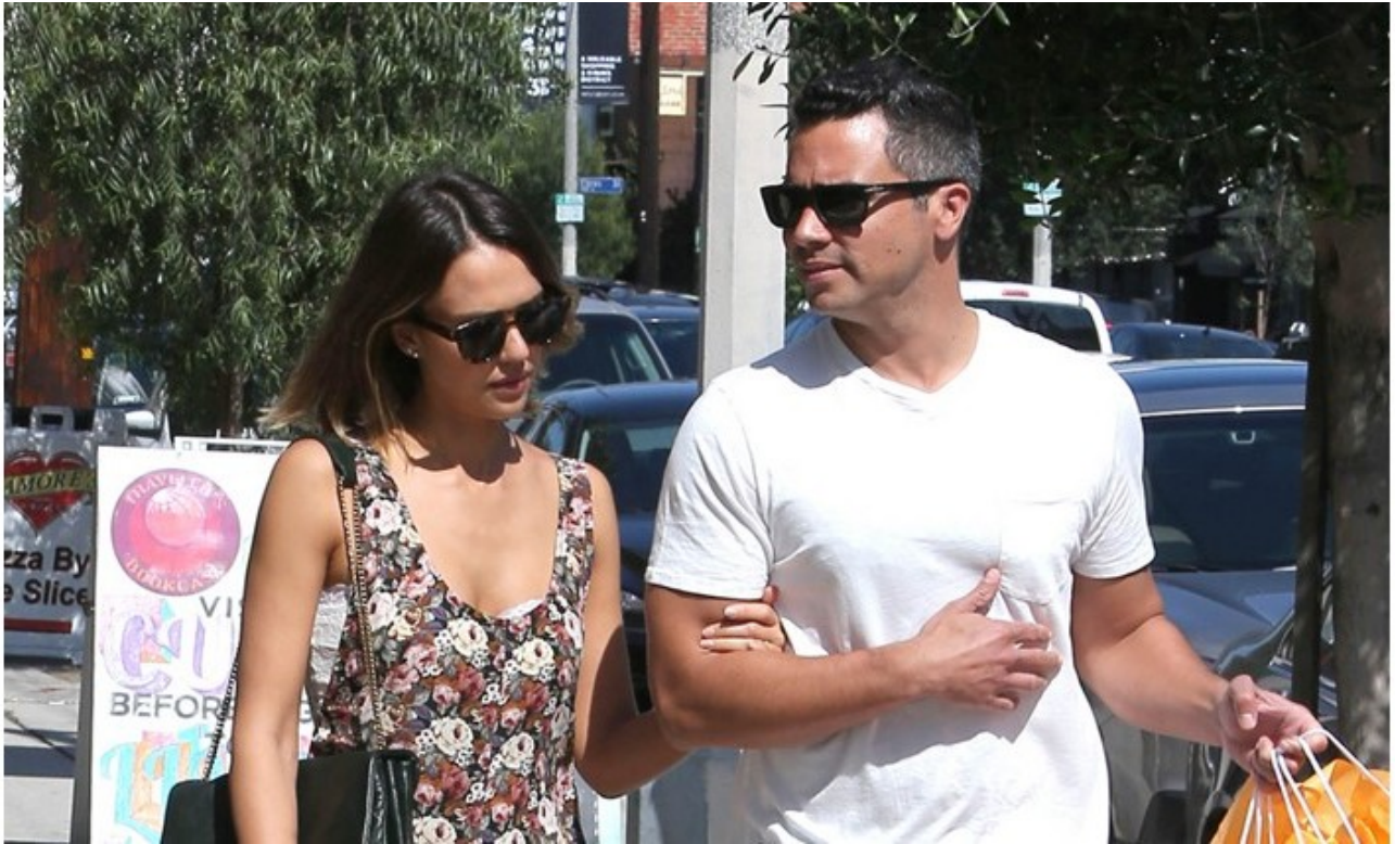
Jessica Alba and Cash Warren