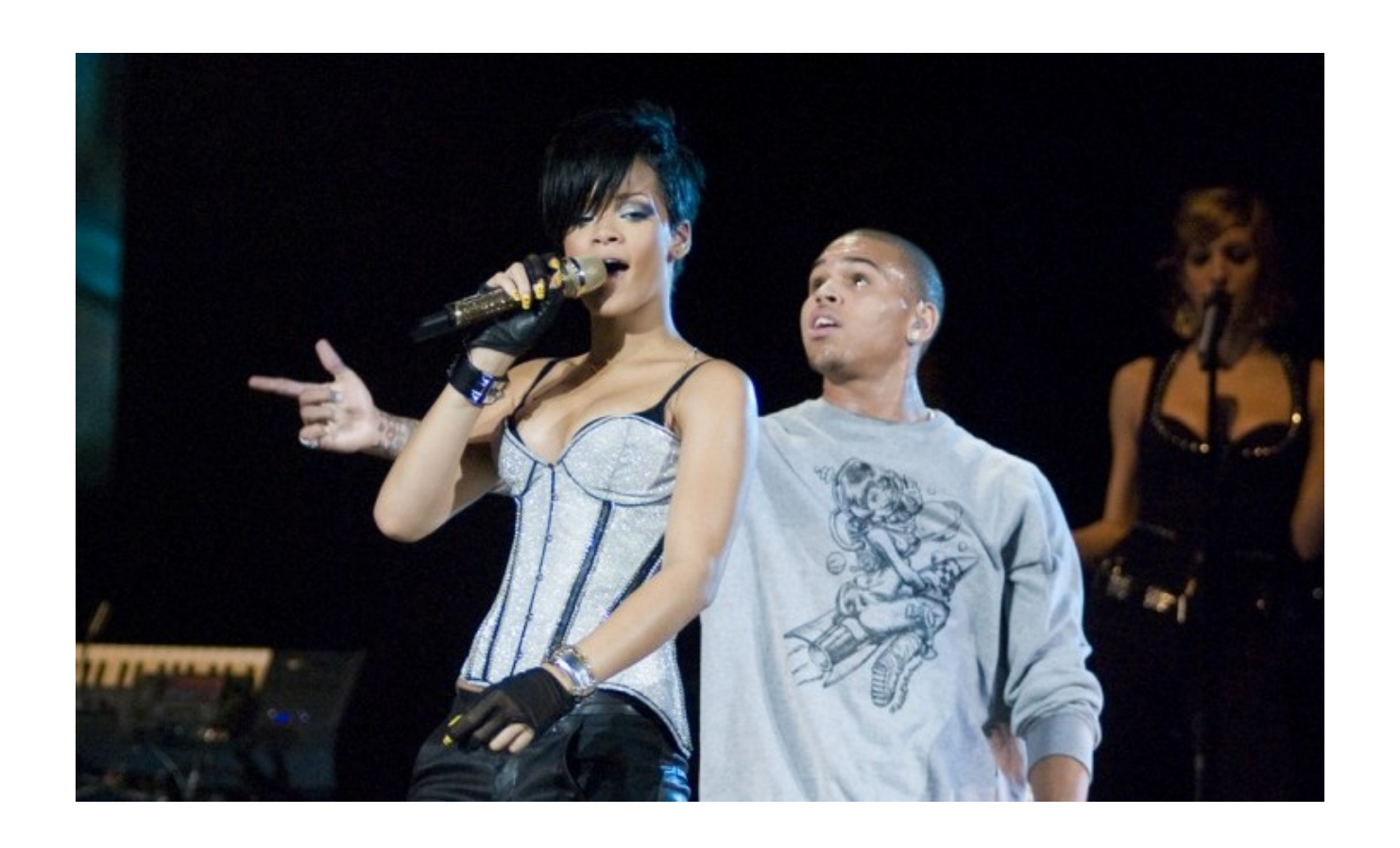
Page 1 of 21