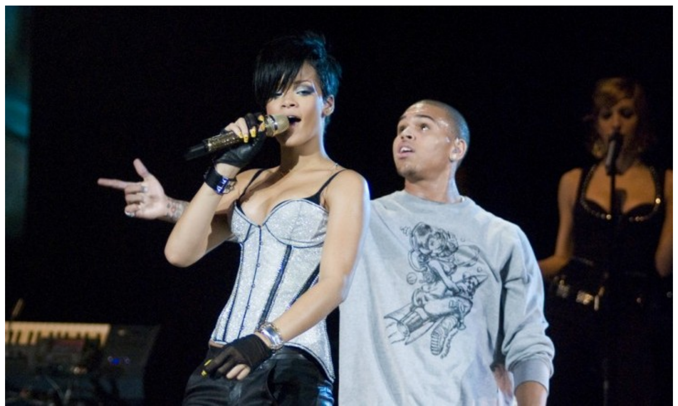
By Molly Jacob

Celebrity scandals. Cheating. Infidelity. These plaster the headlines every day when <u>celebrity couples</u> are concerned. The most famous and beautiful people in the world sadly aren't always satisfied in their own Hollywood couples and often go outside these relationships and love to find more lovers.