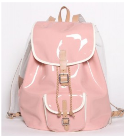
The Takashi bag by Harper Avenue.

In our exclusive author interview, the dating expert gives us a glimpse behind the evolution of clutch and reveals her best relationship advice about online dating and having the courage to find true love. And the best part? If you’re still searching for the perfect gift this holiday season, the Takashi bag by Harper Avenue is a must-have holiday item. Use the discount code below for 20 percent off!