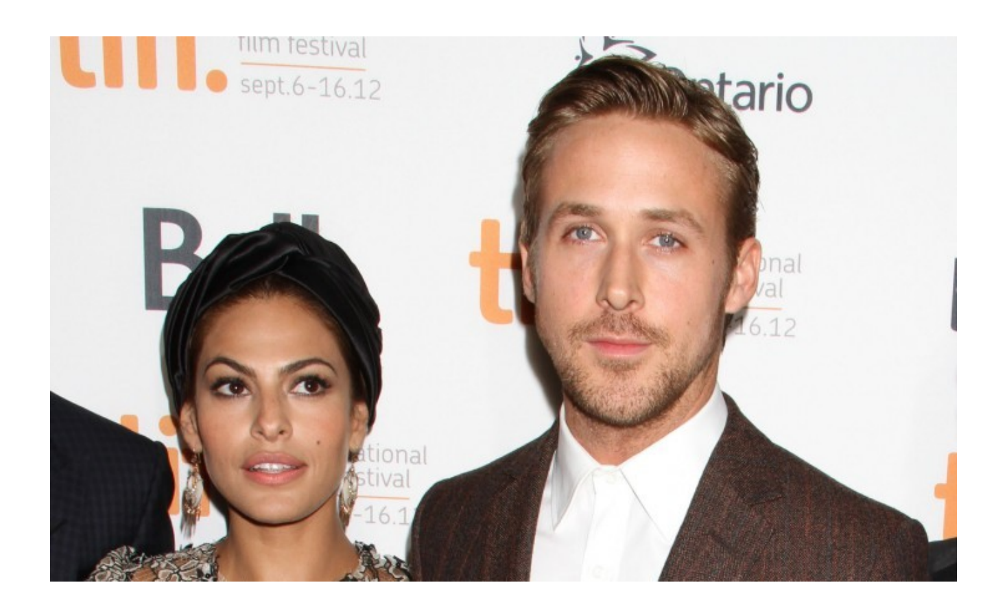
Page 1 of 10