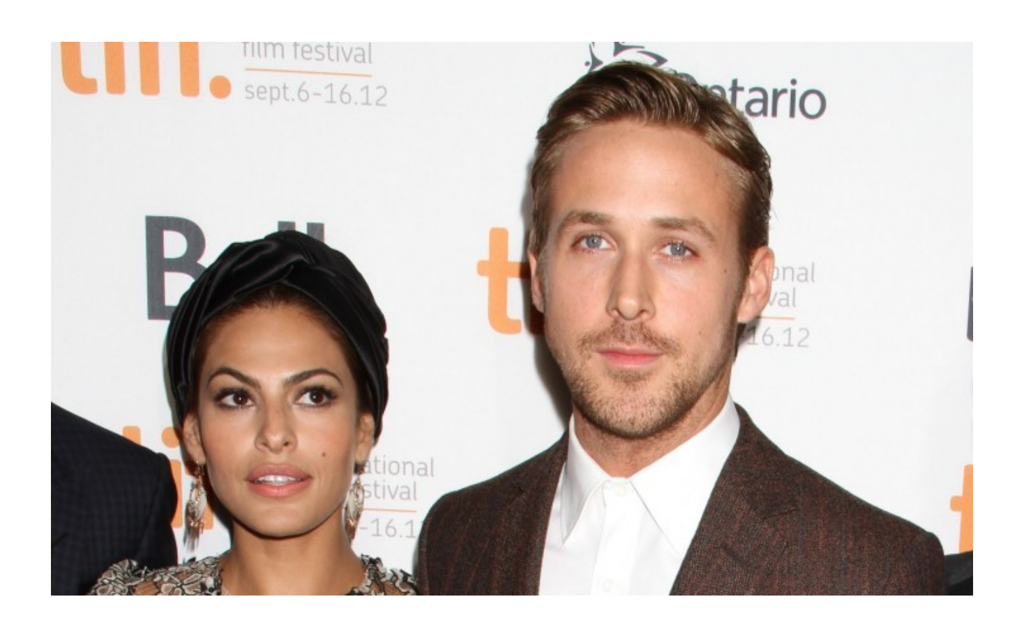
Page 1 of 10