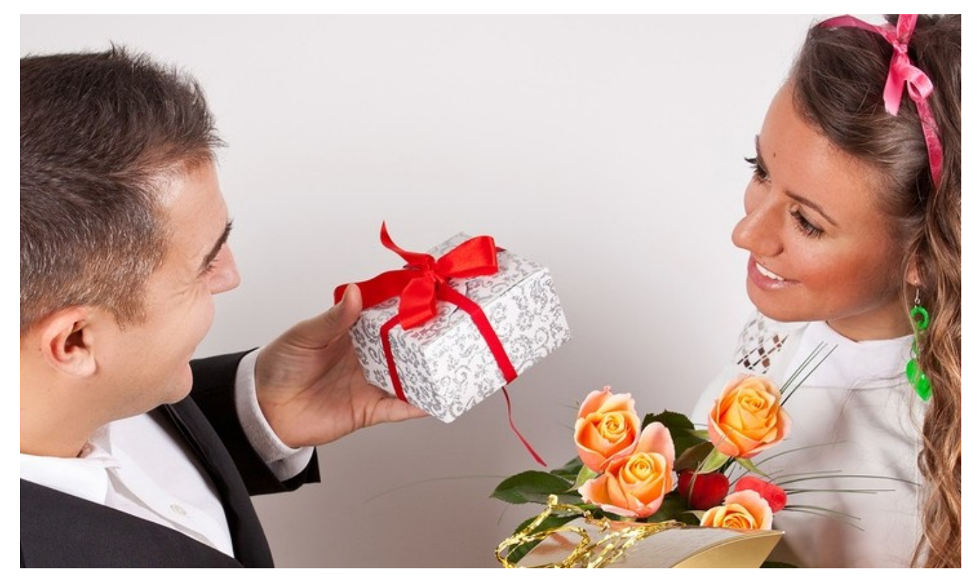
This post is sponsored by PajamaCity.

PajamaCity manufactures and distributes these PJs for both men and women. This line of pajamas is exactly like the ones we had when we were kids, but are now in adult sizes! Their creation stems from a deep desire to appease the inner-child within both men and women. Also, his and her PJs would be the perfect gift for Valentine's Day!