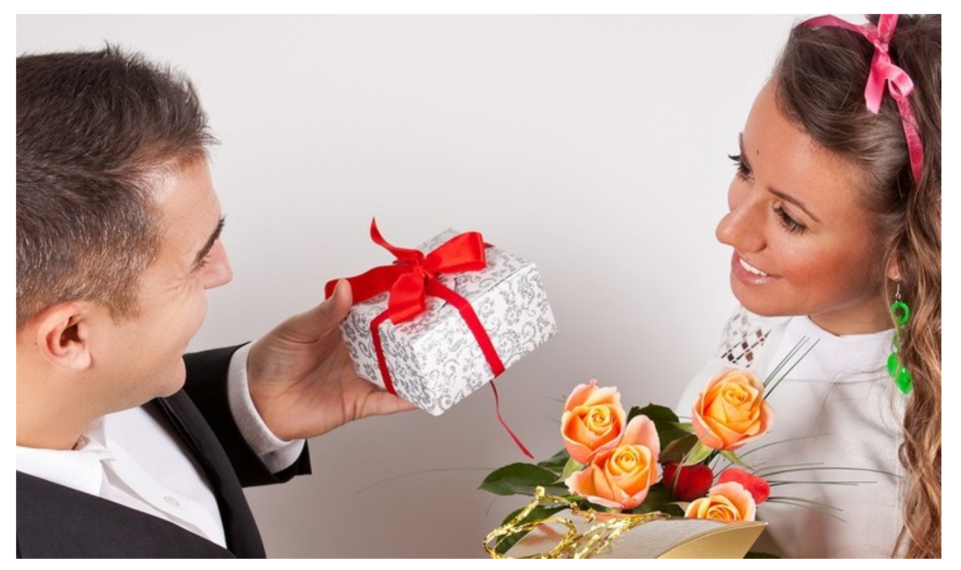
This post is sponsored by Count Me Healthy Jewelry.