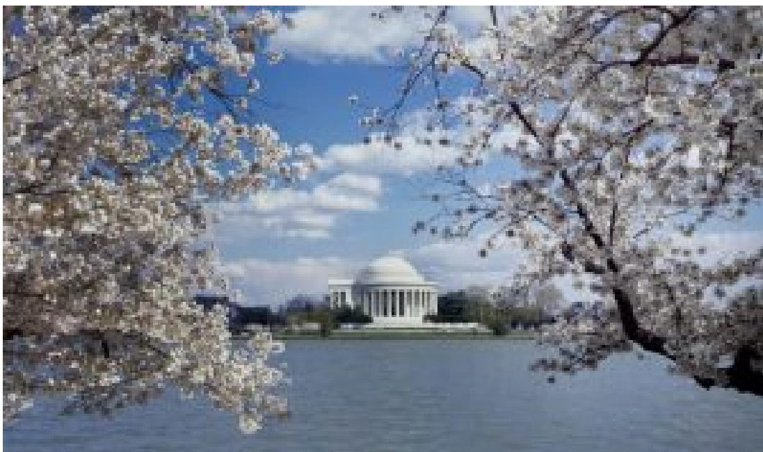
Scenic view of Cherry Blossoms and the Jefferson Memorial in Washington, D.C.

history, politics and government? Then a trip to the nation's capital might be a fun spring break vacation. Late March and early April are perfect times to visit because the city's Cherry Blossom Festival is celebrated during this time, which is super romantic for couples! Almost all of the museums and monuments are free, so you'll save a bunch of money while you explore the capital. Washington, D.C. is easily accessible, especially for those on the East Coast. You can get there by car, bus, train or plane. Don't fret if you live on the West Coast however, round trip flights from LAX to D.C. are as low as $107. Since D.C. is a major city, hotels are on the pricey side, but look for places that include lodging and breakfast, such as the Windsor Park Hotel which goes for $153 a night, and the Comfort Inn for $111 per night. D.C. is also known for its unique restaurants like Bindaas, which is famous for its Indian-inspired menu, and &Pizza, where you can customize your own pizza and gulp down artisanal soda.