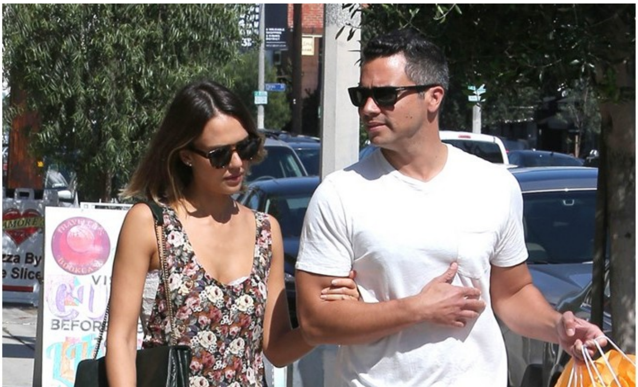
Jessica Alba and Cash Warren

What a fantastic love story this celebrity couple shares! Alba