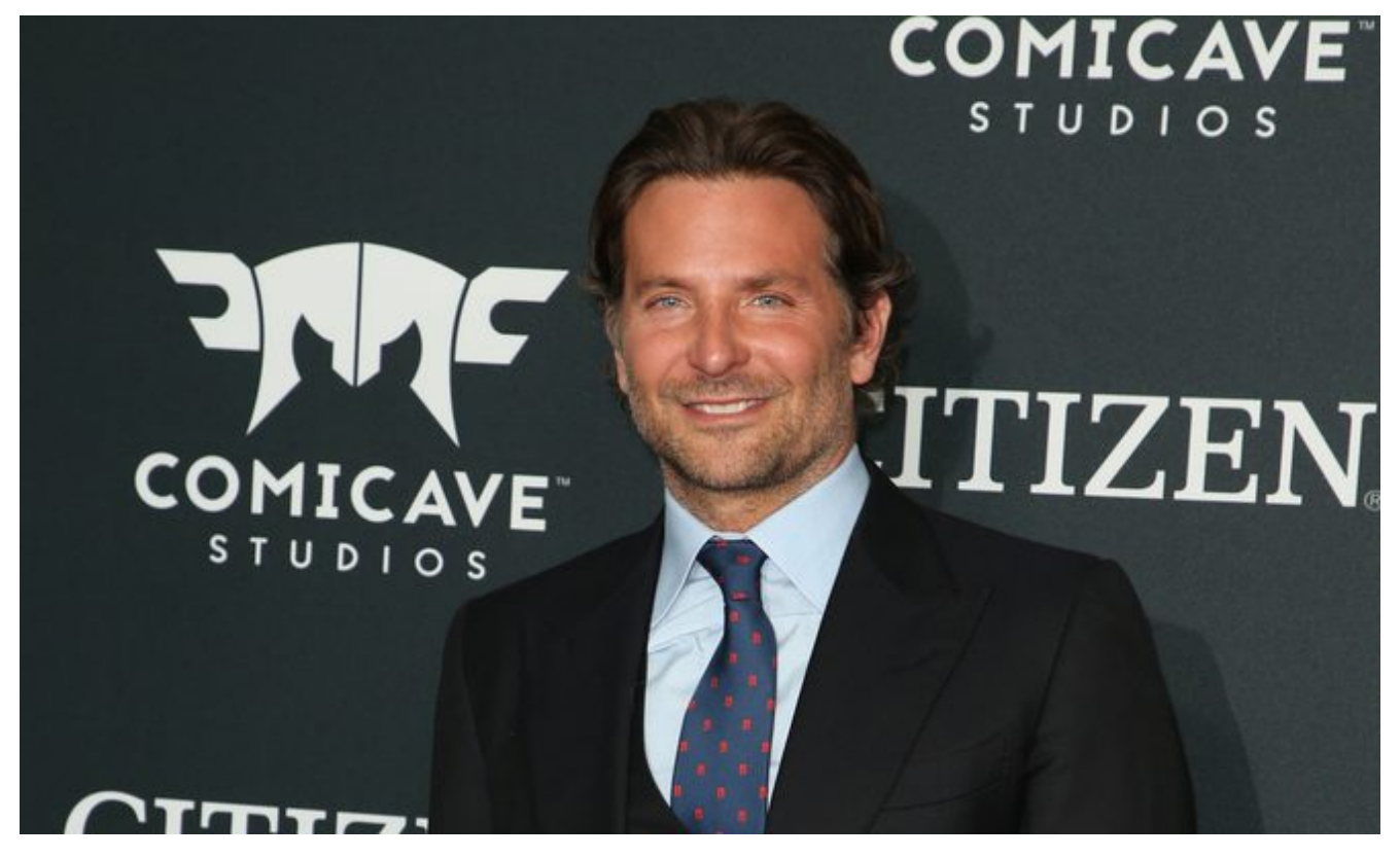
Page 1 of 14