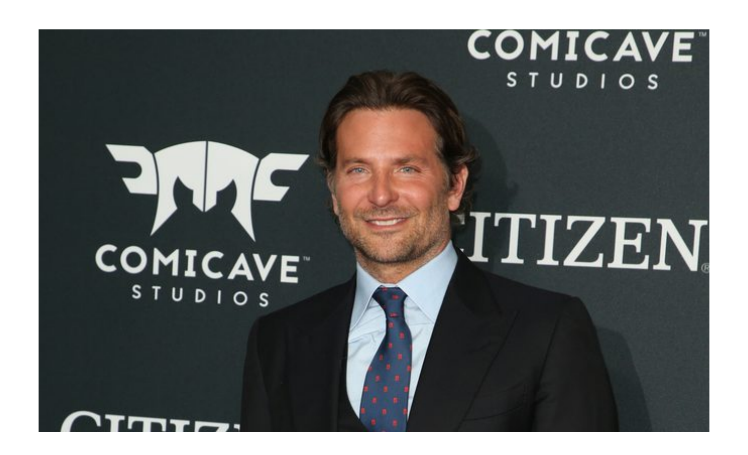
Page 1 of 19