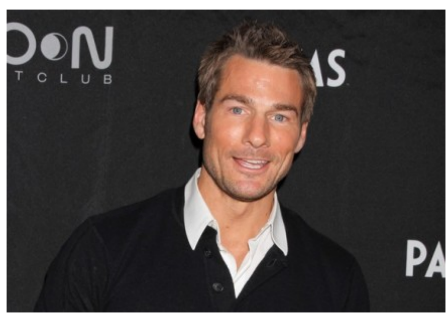
In spite of leaving