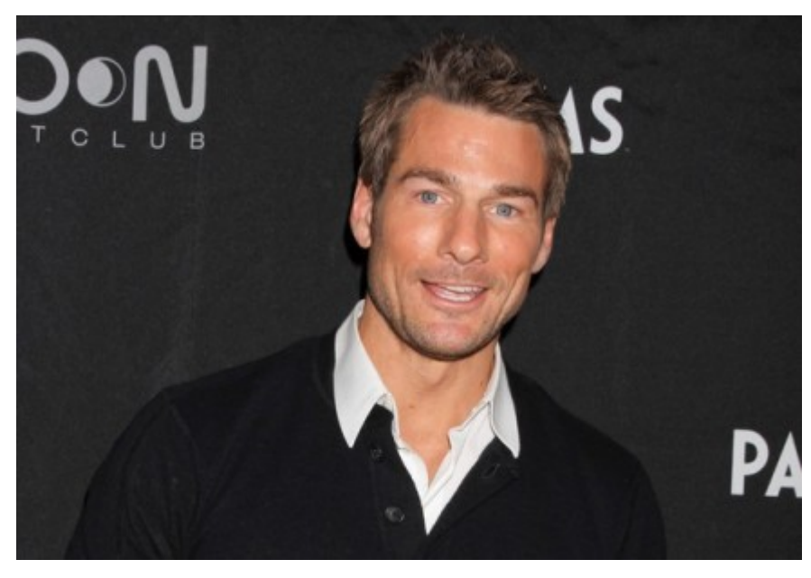
By Krissy Dolor

The vacation destination theme continued on week six of ABC's The Bachelor as Brad Womack and the remaining eight bachelorettes took another trip — this time, to Costa Rica. With the lush green landscape, a waterfall and a volcano view from The Springs Resort and Spa, what's not to like about week six?