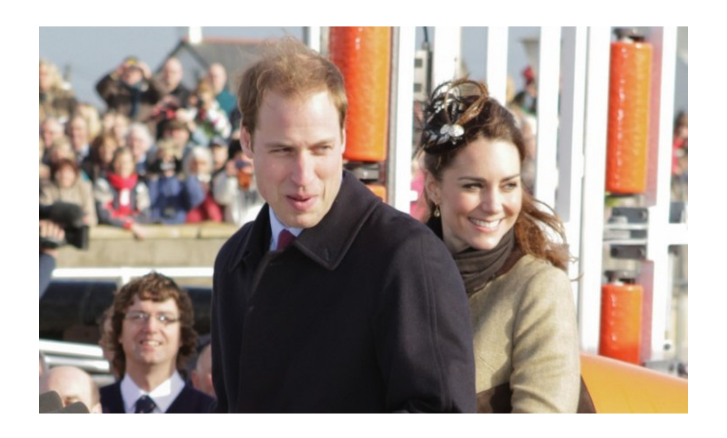
Page 1 of 20