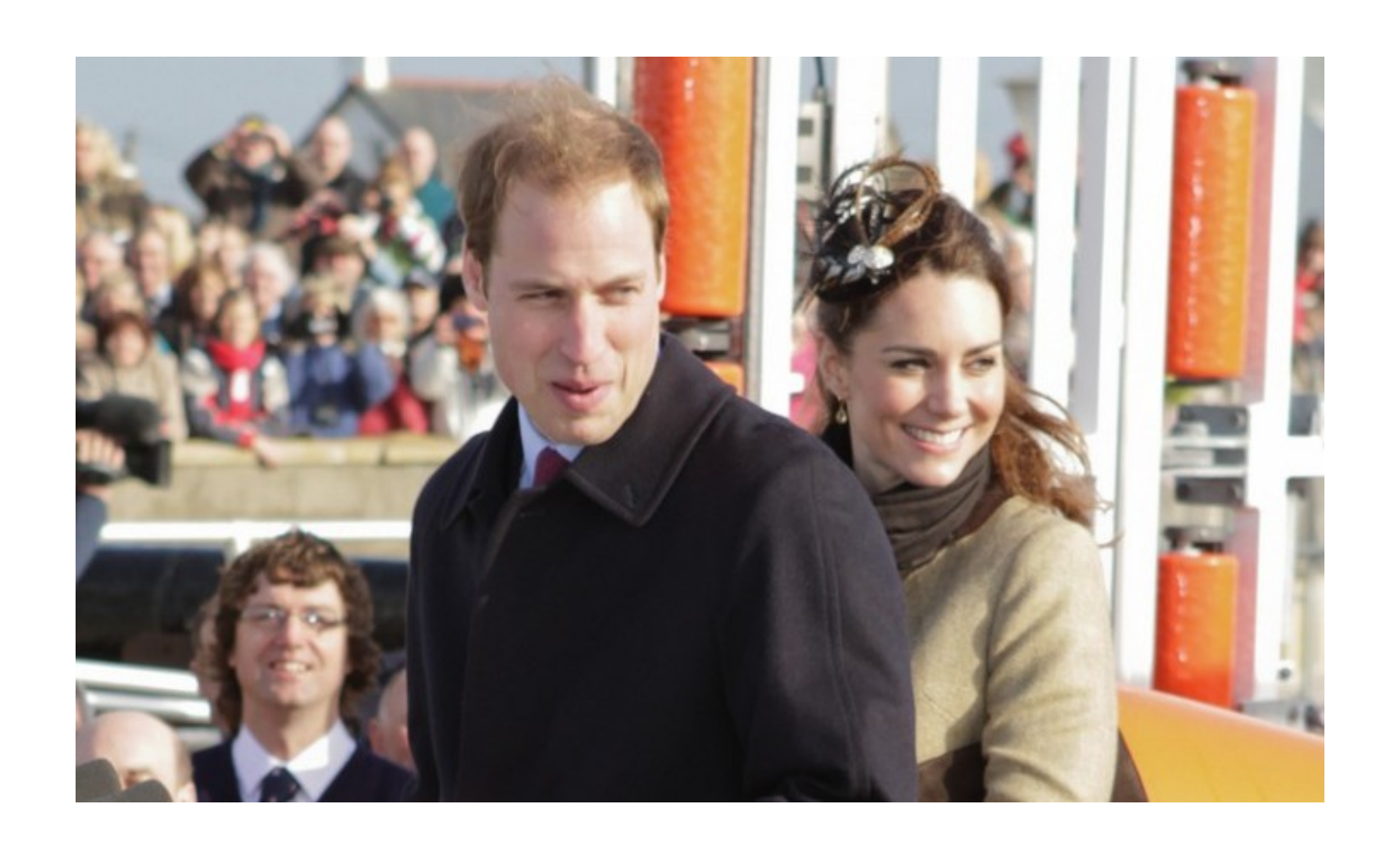
Page 1 of 10