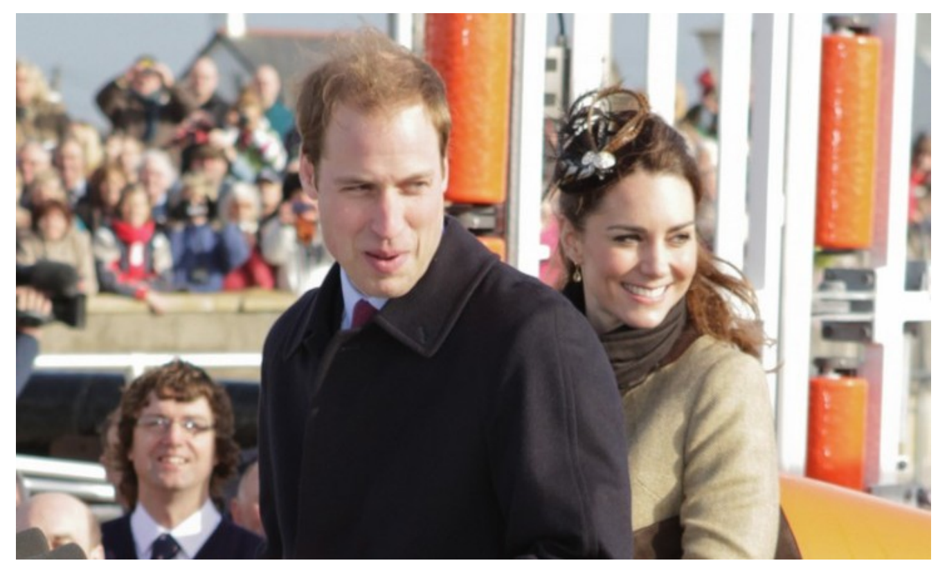
By Brittany Stubbs and Molly Jacob

While flowers and chocolates are nice, in Hollywood, Valentine's Day is usually done a little different. Although there are many ways to show your love, check out how some of our favorite celebrity couples are doing it! Celebrity love is definitely in the air this season, and there's no better way to show it than with extravagant gestures. If you need some romance inspiration, check out the five famous couples below: