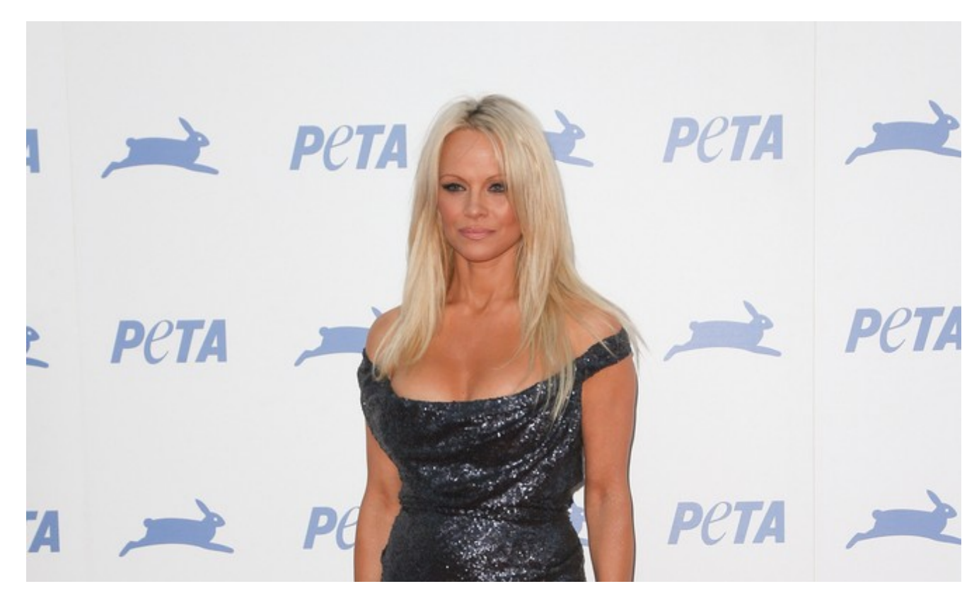
By Katanya Royster

What's the first thing you think of when someone says Sin City? Okay, after legalized prostitution. That's right: quickie Vegas weddings in chapels illuminated with neon lights. The fact is, Las Vegas issues approximately 100,000 marriage licenses each year and boasts almost as many wedding chapels as it does casinos. For famous couples, those quickie celebrity weddings are typically followed by quickie divorces and embarrassing publicity. Vegas' abundance of 24-hour bars makes us wonder if some of our favorite celebs were under the influence of something other than love when they tied the knot, Vegas-style. Here are a few examples: