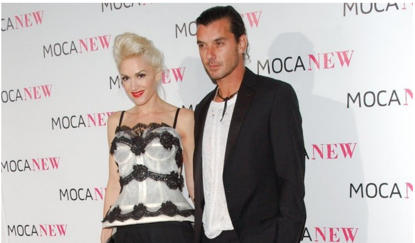
Gwen Stefani and Gavin Rossdale