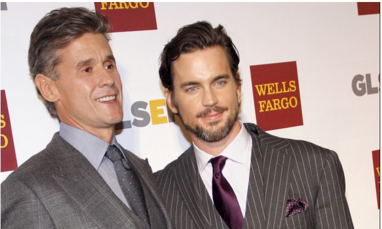
Simon Halls and Matt Bomer

The 'Magic Mike' star married Halls in 2011, a year before the