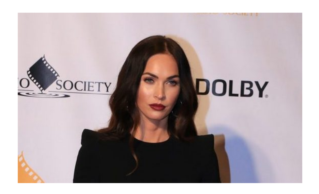
Page 1 of 10