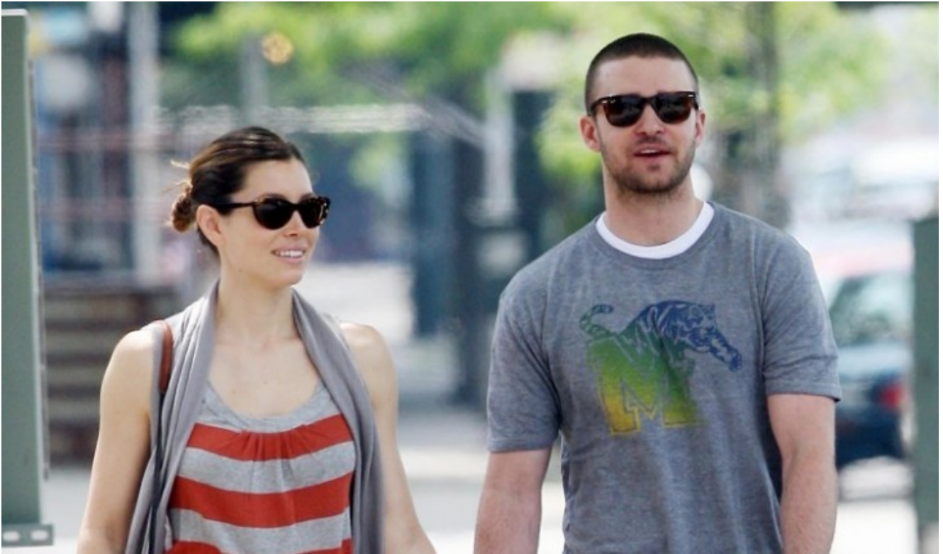
Jessica Biel and Justin Timberlake

The duo that sweats together, stays together! This famous couple seems to believe this truth, as they are often seen jogging together.