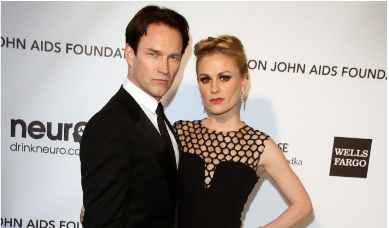
Stephen Moyer and Anna Paquin

These sexy stars of 'True Blood' wed in 2010, paying no