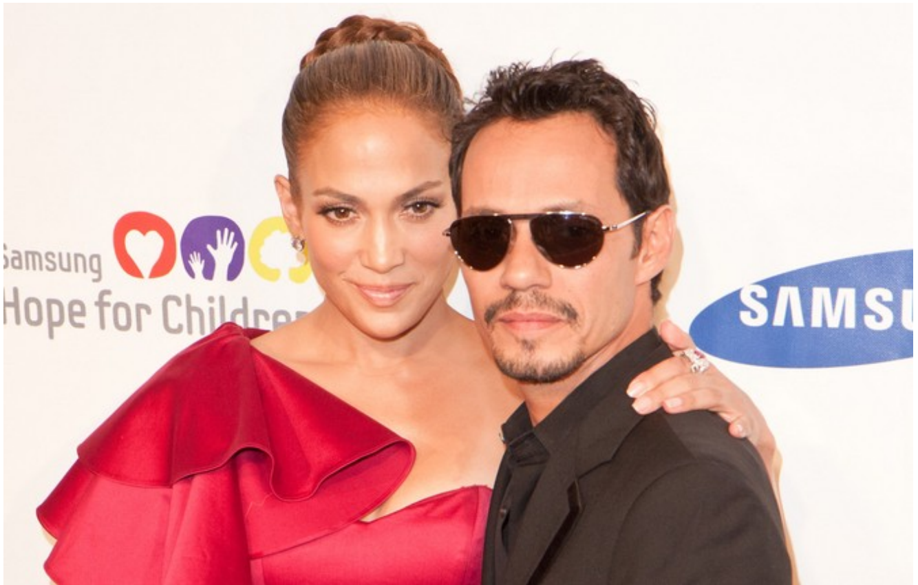
Jennifer Lopez and Marc Anthony

Although they're no longer together, the two singers co-parent and do business together. These celebrity exes didn't let their break-up get in the way of their children or career.