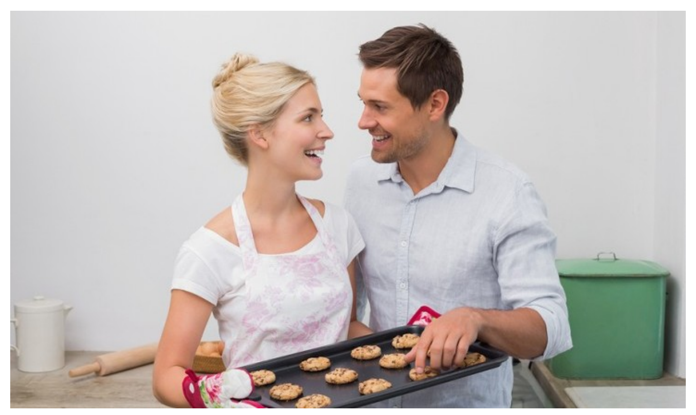
This post is sponsored by Bands for Arms.