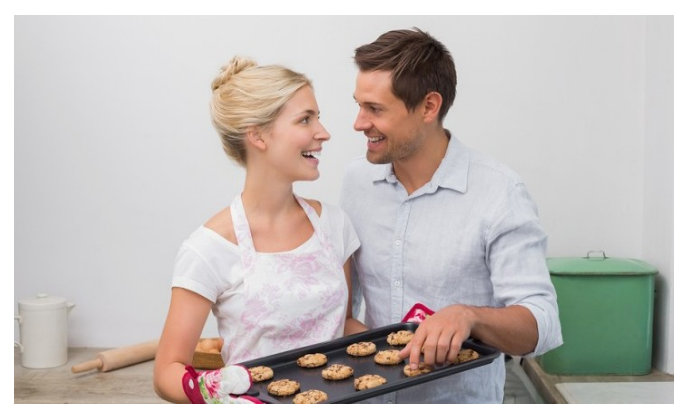
This post is sponsored by 'Til DIVORCE Do Us Part.