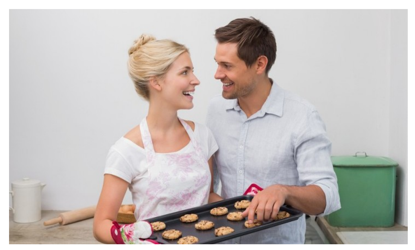
This post is sponsored by Dear Clark.