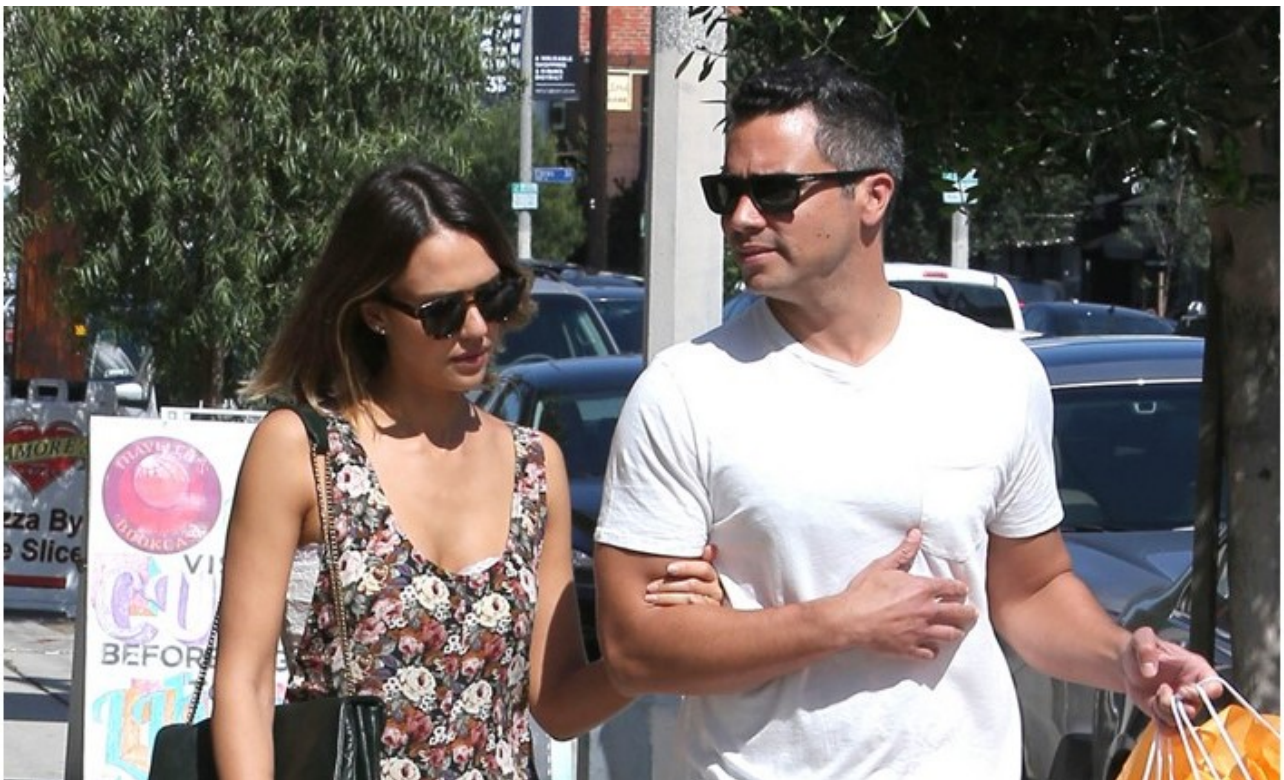
Jessica Alba and Cash Warren

What a fantastic love story this celebrity couple shares! Alba met Warren on the set of 'Fantastic Four' in 2004, and by