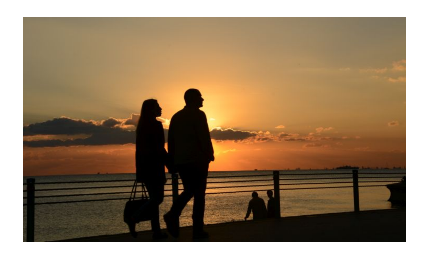
Page 1 of 20