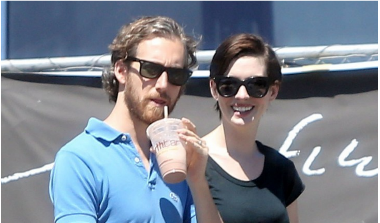
Adam Shulman and Anne Hathaway

This famous couple enjoyed a nice summer getaway in sunny Spain! The pair spent time on a yacht, soaking up the sun and playing in the water together. Photo: LRR/FAMEFLYNET PICTURES