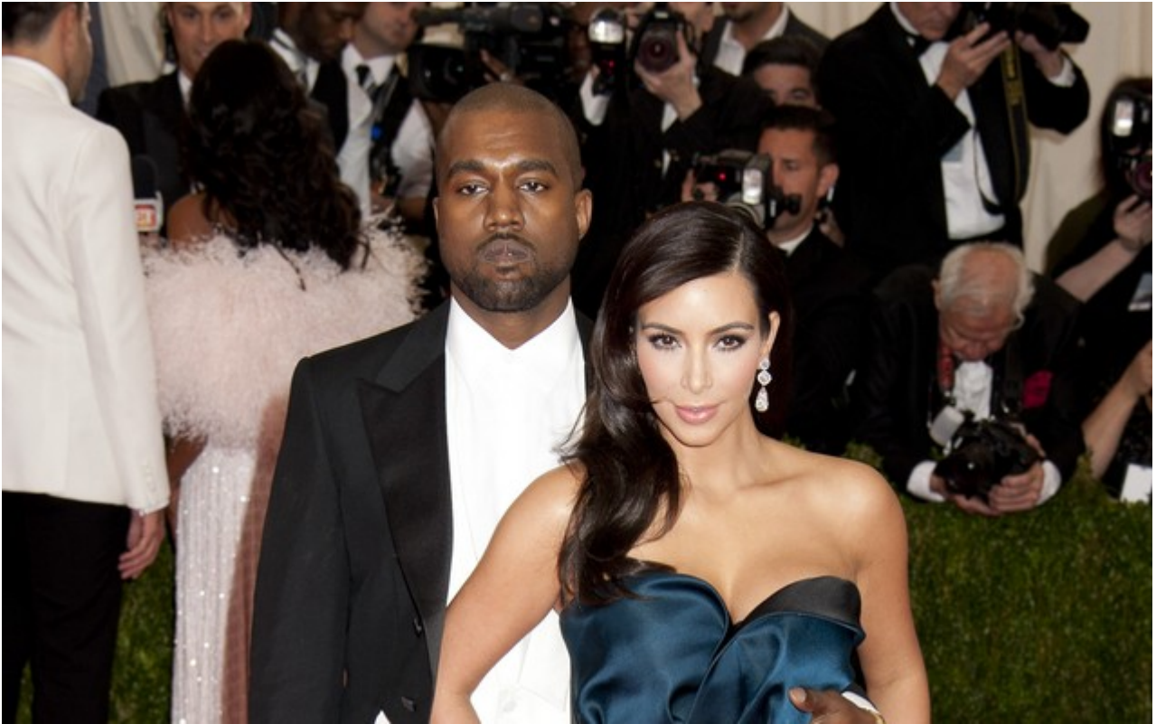
Kanye West and Kim Kardashian

This celebrity couple is known for being extremely fashionable. It's no surprise that the Wests, who were seen at the Grammys participating in some serious PDA, looked photo ready in their designer duds.