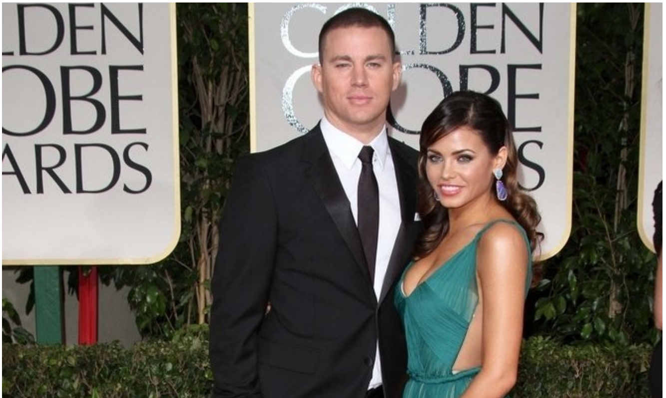
Channing Tatum and Jenna Dewan-Tatum

Since their fairytale began on the set of 'Step Up' in 2006,