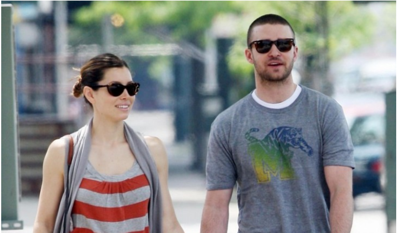
Jessica Biel and Justin Timberlake

The duo that sweats together, stays together! This famous couple seems to believe this truth, as they are often seen jogging together.