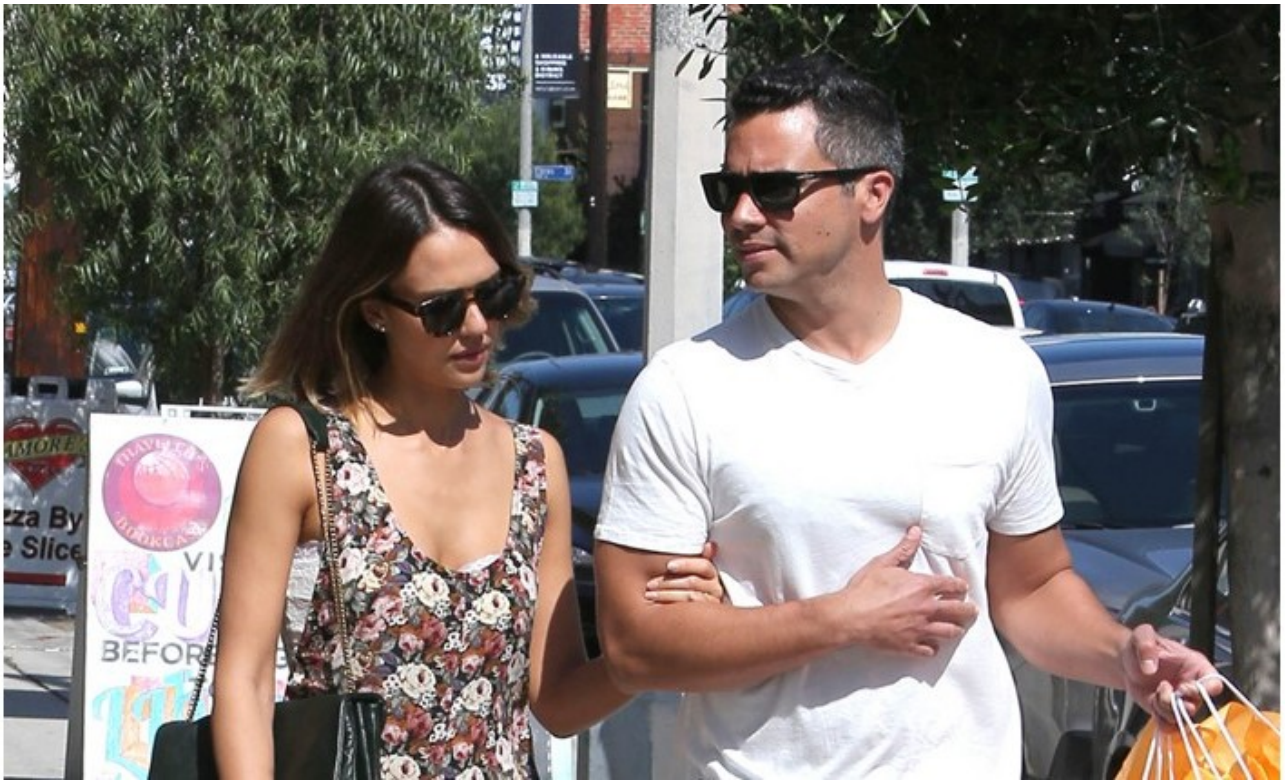
Jessica Alba and Cash Warren

What a fantastic love story this celebrity couple shares! Alba met Warren on the set of 'Fantastic Four' in 2004, and by 2008, the two had said "I do." The pair later welcomed daughters Honor and Haven.