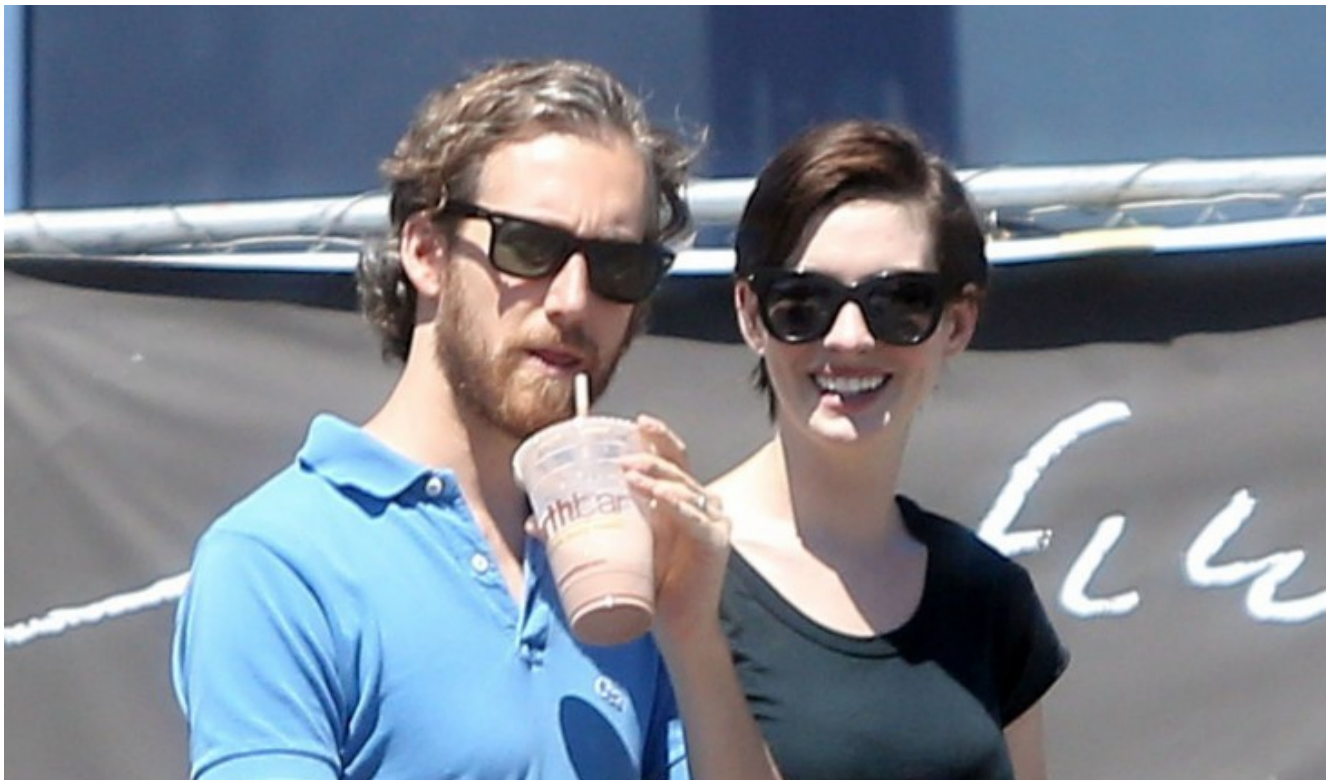
Adam Shulman and Anne Hathaway

This famous couple enjoyed a nice summer getaway in sunny