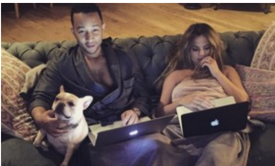
John Legend and Chrissy Teigen.

1. Take breaks from each other: Chrissy Teigen and John Legend may seem like a couple that is together 24/7, but they do spend time apart. According EOnline.com , the couple values trips away from each other because it allows them to miss being together and appreciate their relationship. Spending time apart really does make the heart grow fonder!