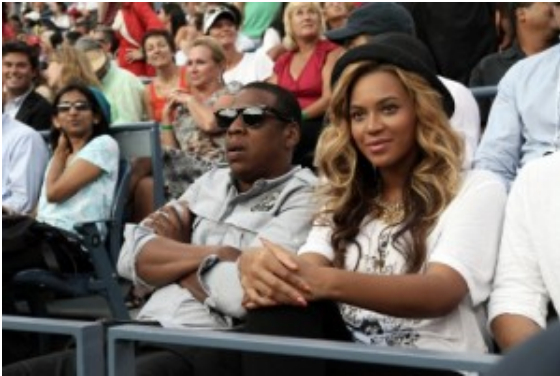
Jay-Z and Beyoncé.

been under the spotlight in recent years over a cheating scandal. Jay-Z can assure everyone that not every marriage is perfect. The rapper spoke with RollingStone.com and revealed that he had to rebuild his marriage with Beyoncé in order for them to be happy again. Sometimes hardships can make a marriage crumble, but sometimes you can make it work at the end of the day!