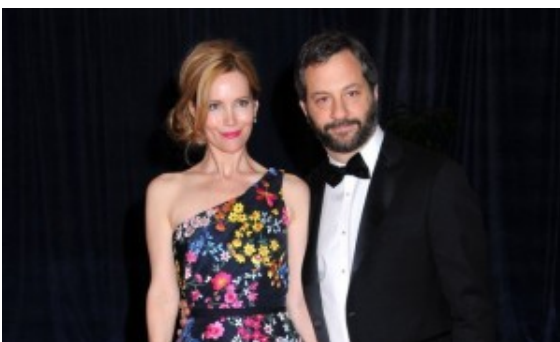
Leslie Mann and Judd Apatow.

5. Watch Oprah together: The funny duo Leslie Mann and Judd Apatow have worked together on many romantic comedies together and have been married for 20 years! The director shared with Vice.com that they both watch Oprah's SuperSoul Sunday and then apply lessons from the show to their marriage each week. Television shows that give you relationship advice can be helpful for you and your partner!