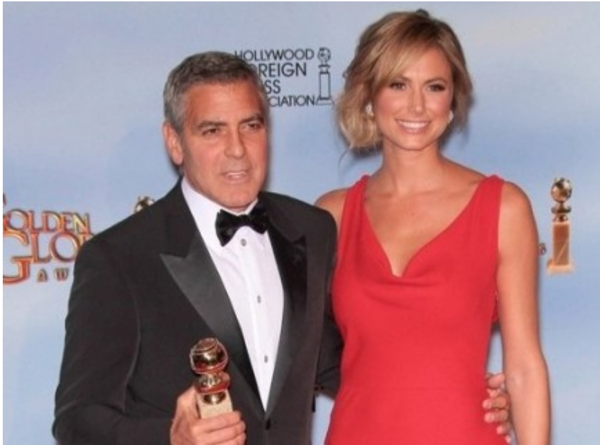
Dancing with the

Stars alum Elisabetta Canalis, who dated George Clooney for two years until their split in June, recently revealed some reasons behind her split with the actor, reports People . Canalis has been quoted in a Questo Amore (This Love) , a new book by Italian journalist Bruno Vespa, where she says she had a “father-daughter relationship” with Clooney. “[Clooney] has been special for me, and very important, just as a father would be,” said Canalis in the book. “Between us there was more of a father-daughter relationship.”